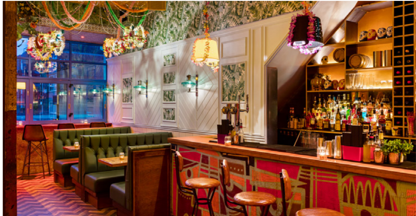
Former operation photos for indicative purposes