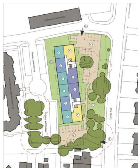
Apartment Scheme (34 Units)