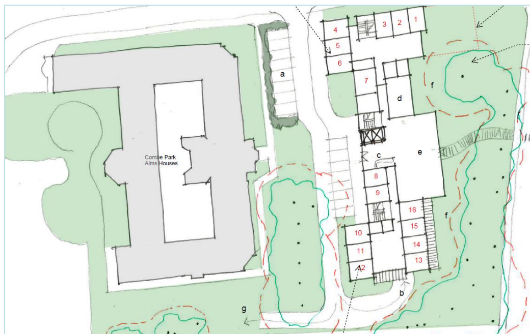
Care Home Scheme (71 Bedrooms)