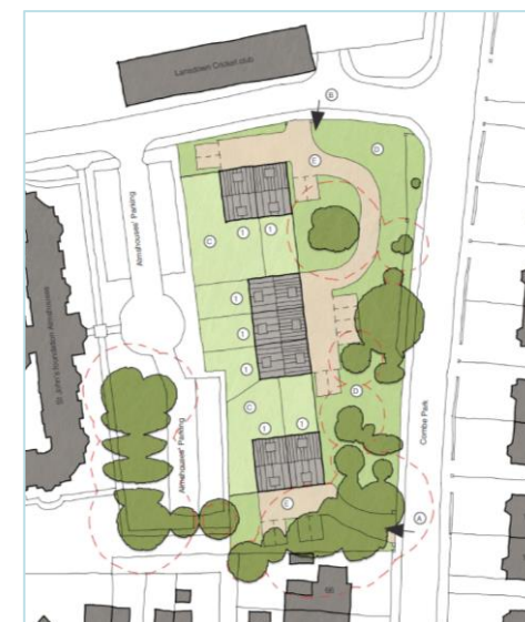
Town House Scheme (7 Units)