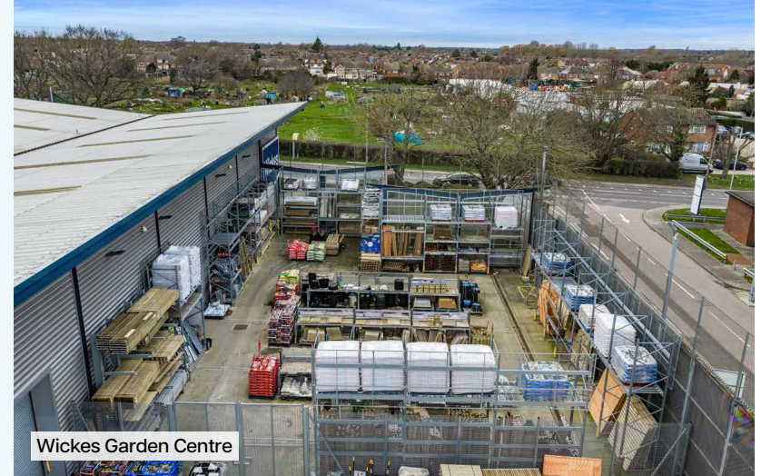
Wickes Garden Centre

The SEH BAC building provides a clear internal eaves height of approximately 4.85 metres. The configuration supports a showroom-style layout with modern façade glazing to the main road. Both units sit prominently on Baynes Place / Waterhouse Lane within a well-established retail warehouse environment.