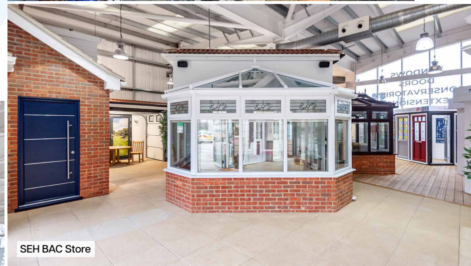
SEH BAC Store