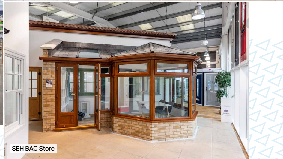
SEH BAC Store