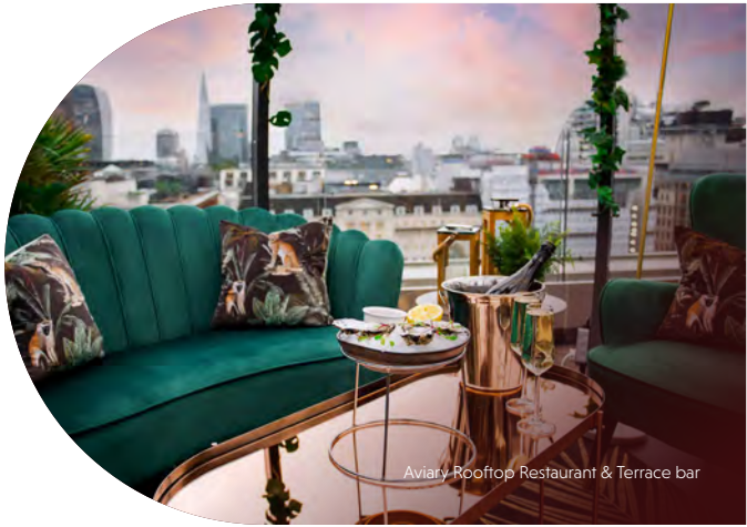
Aviary Rooftop Restaurant & Terrace bar