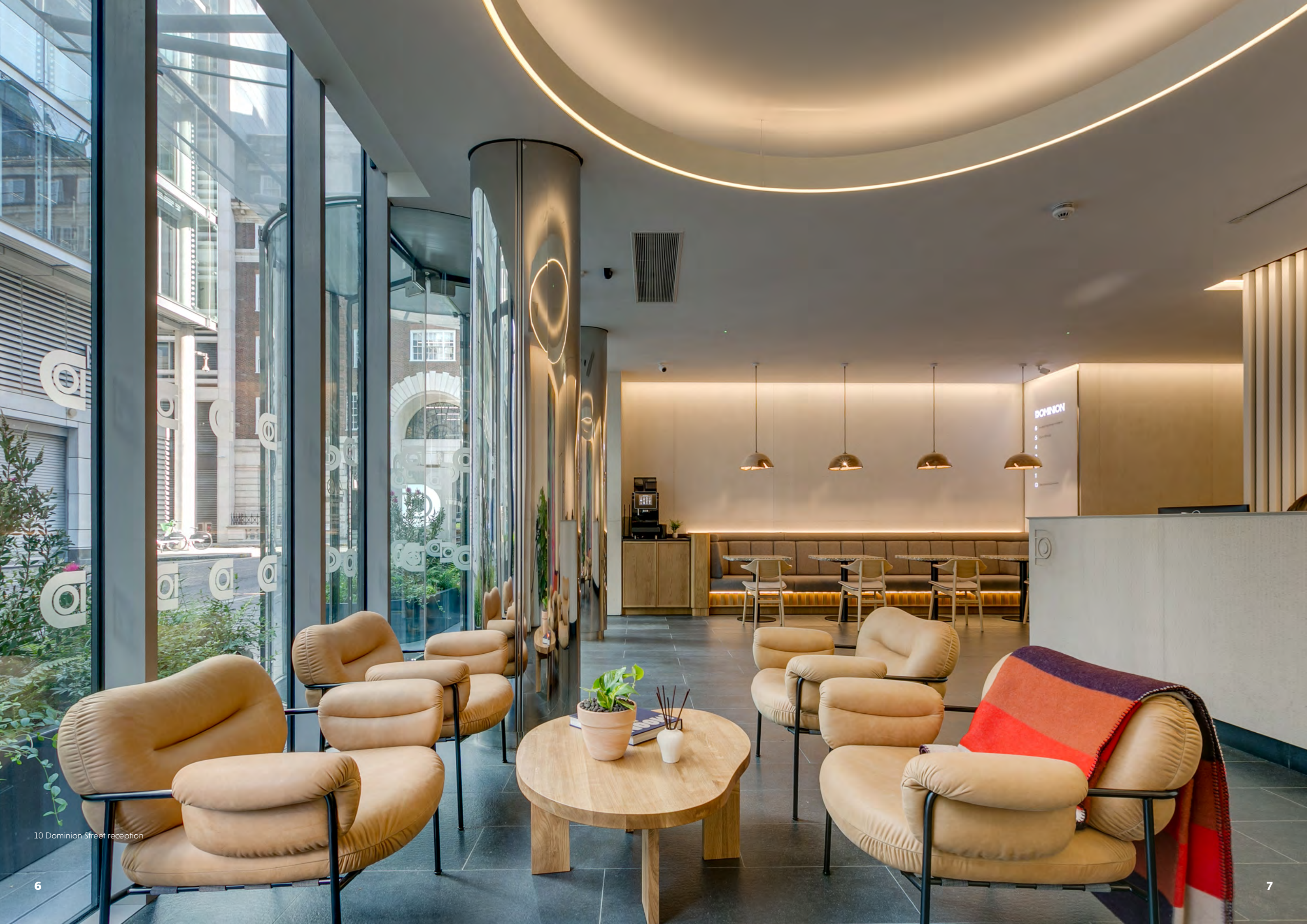
10 Dominion Street reception