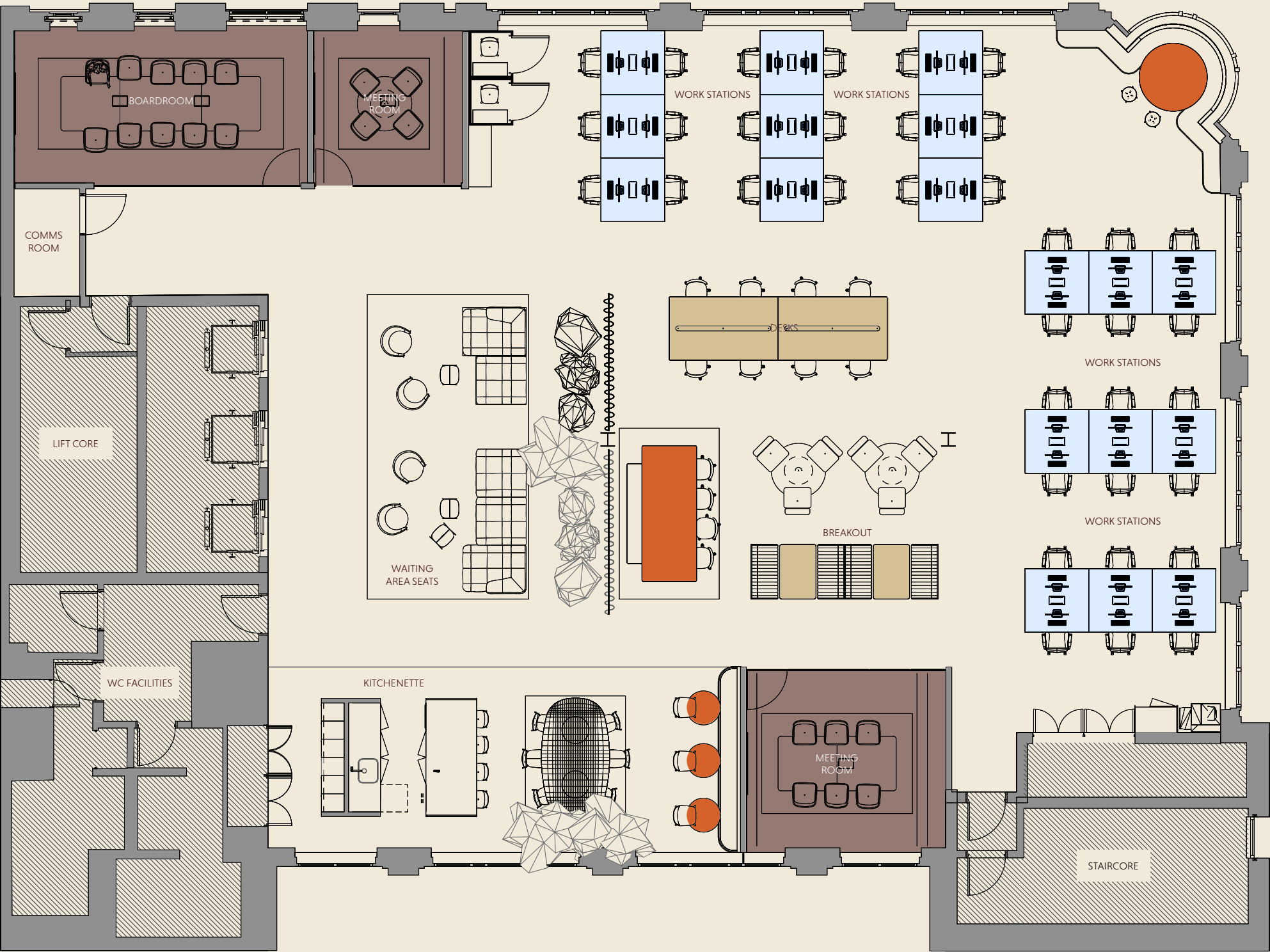
INDICATIVE FULLY FITTED SPACE PLAN