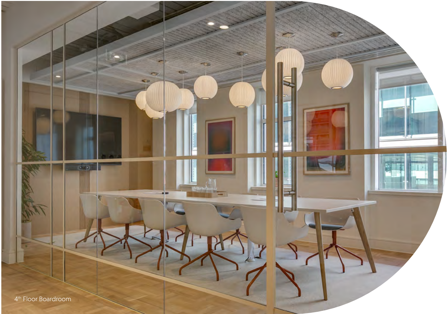
4 th Floor Boardroom