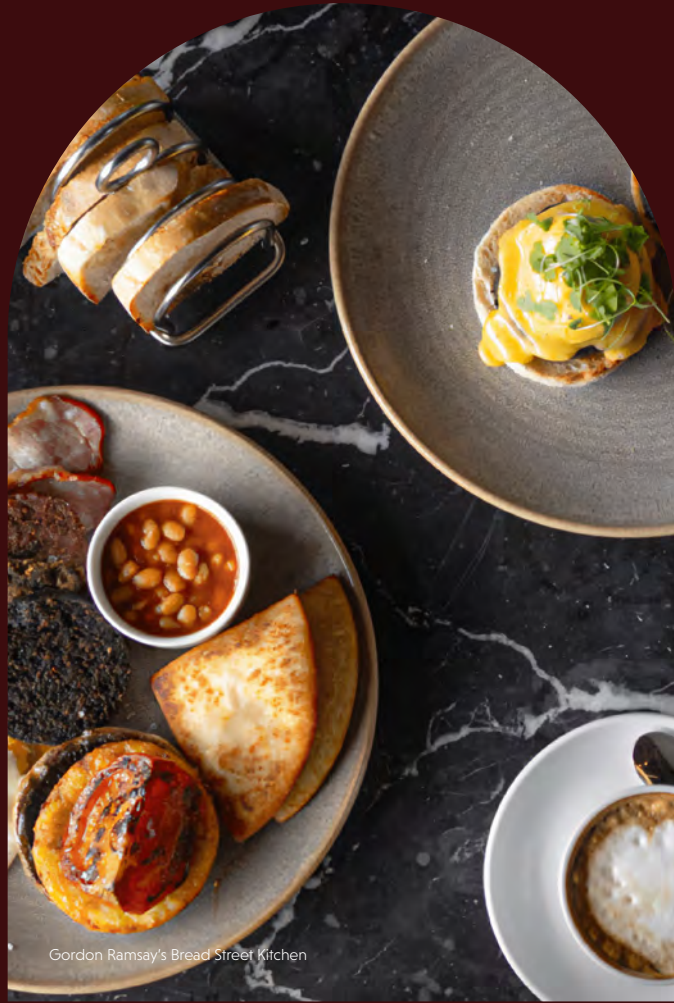
Gordon Ramsay's Bread Street Kitchen

The City of London is a vibrant neighbourhood of internationally renowned culinary, social and lifestyle destinations attracting a discerning crowd. With luxury health club, Third Space and Gordon Ramsay's Bread Street Kitchen at the end of the street, expect nothing less.