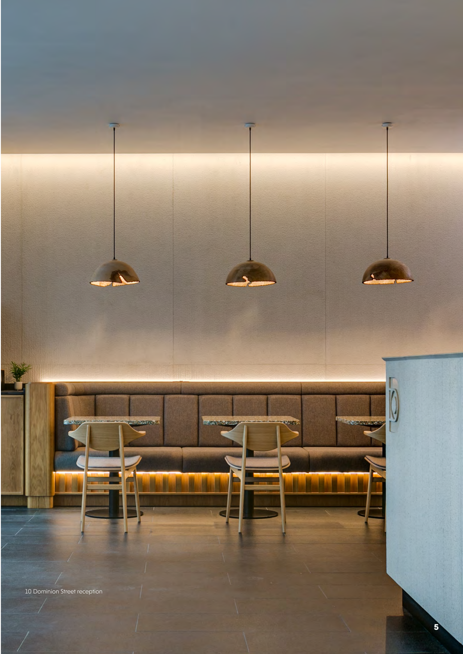
10 Dominion Street reception

OWNED & MANAGED BY ROMULUS No matter your question or query, you will always deal directly with the landlord through one dedicated point of contact.