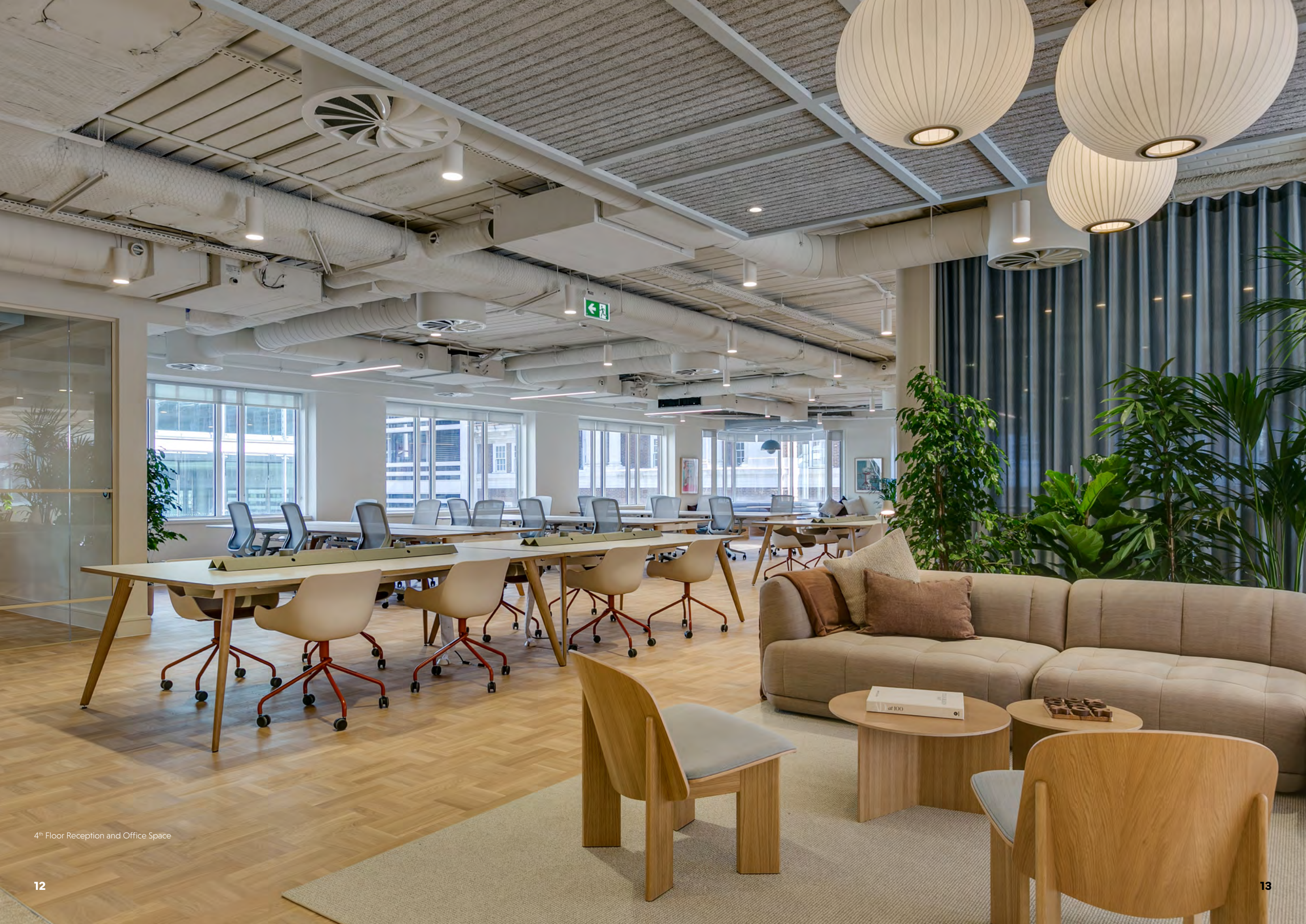
4 th Floor Reception and Office Space