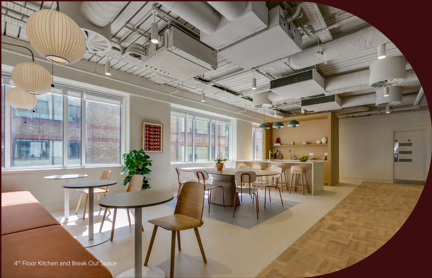
4 th Floor Kitchen and Break Out Space