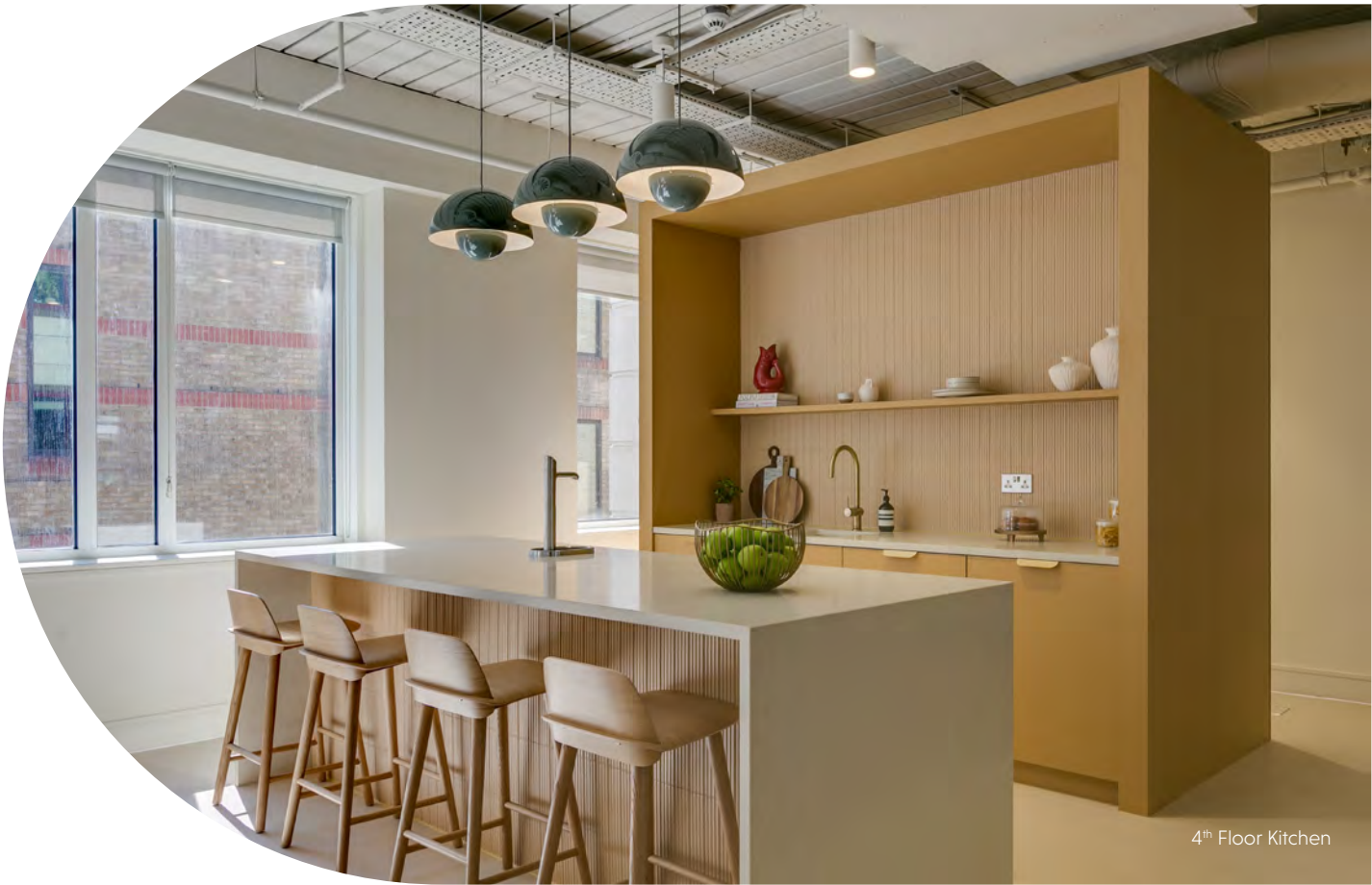
4 th Floor Kitchen