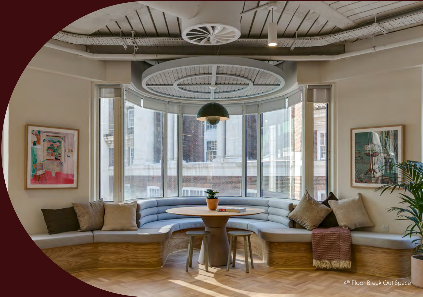
4 th Floor Break Out Space