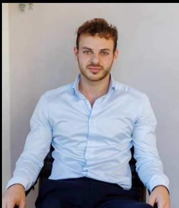
DANIEL JACKSON AGENCY dj@belcor.london 07725 203 254