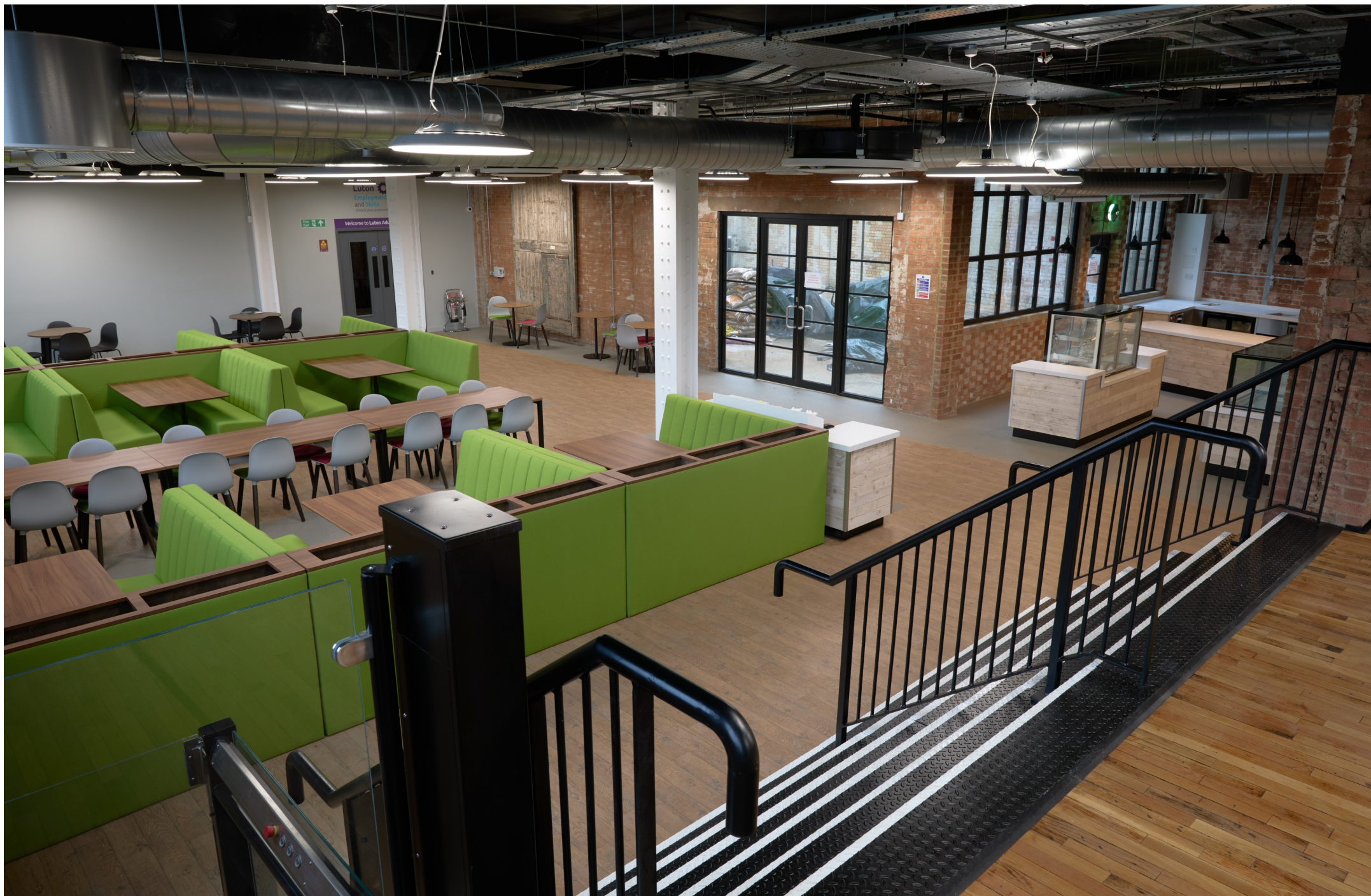
CAFÉ SEATING SPACE