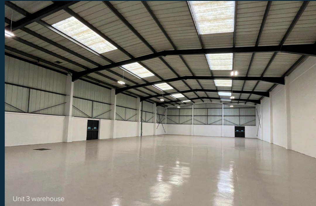
Unit 3 warehouse

The units are available to let on a leasehold basis.