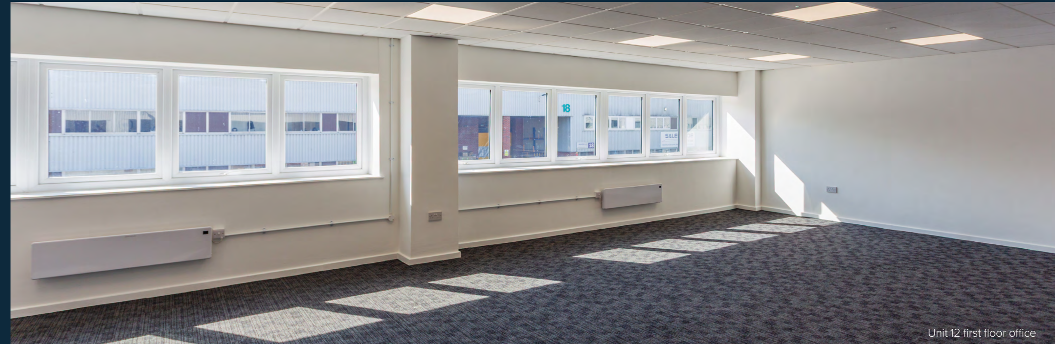
Unit 12 first floor office