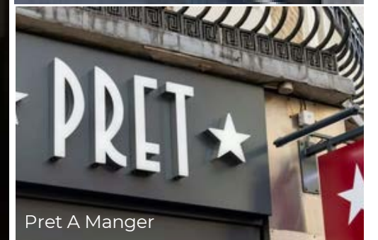
Pret A Manger