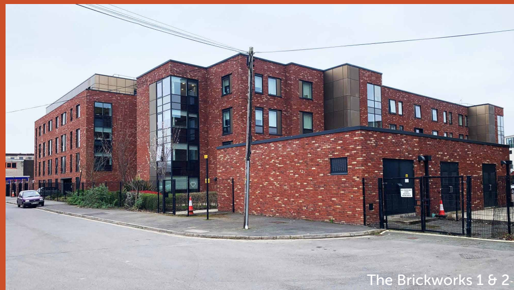
The Brickworks 1 & 2