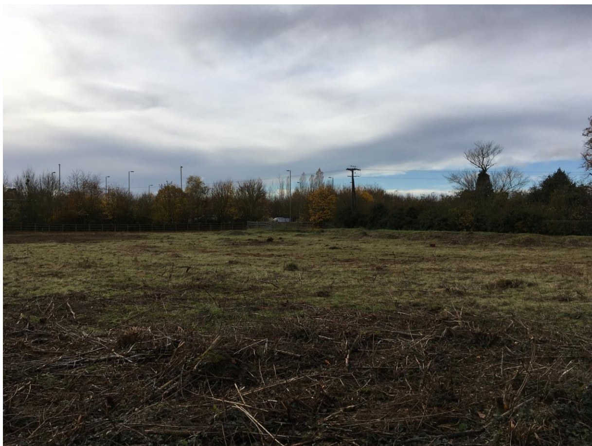
View from within the site looking south west