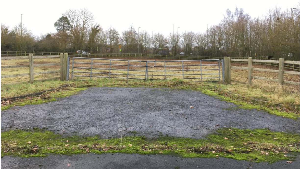
View of site looking east from Wallingford Road