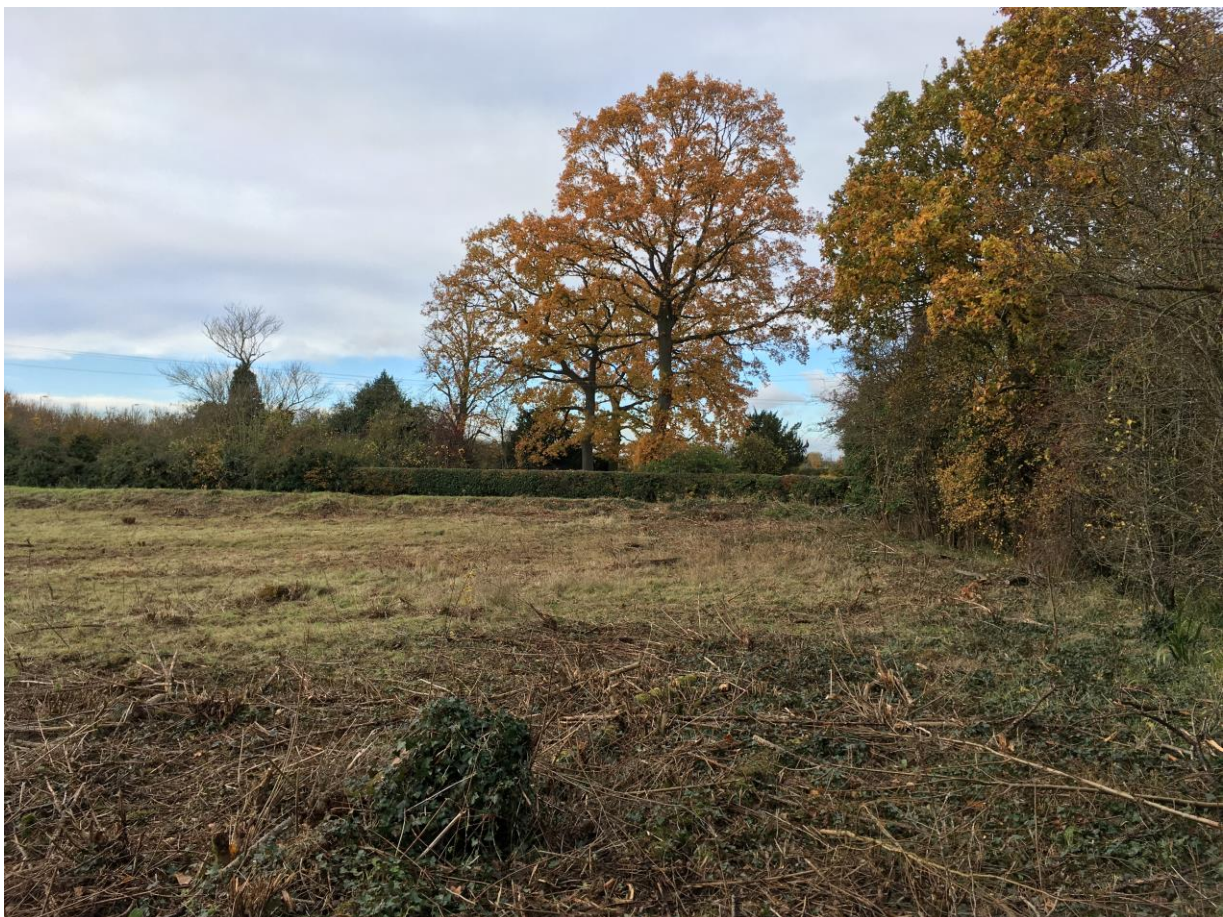
View from within the site looking west