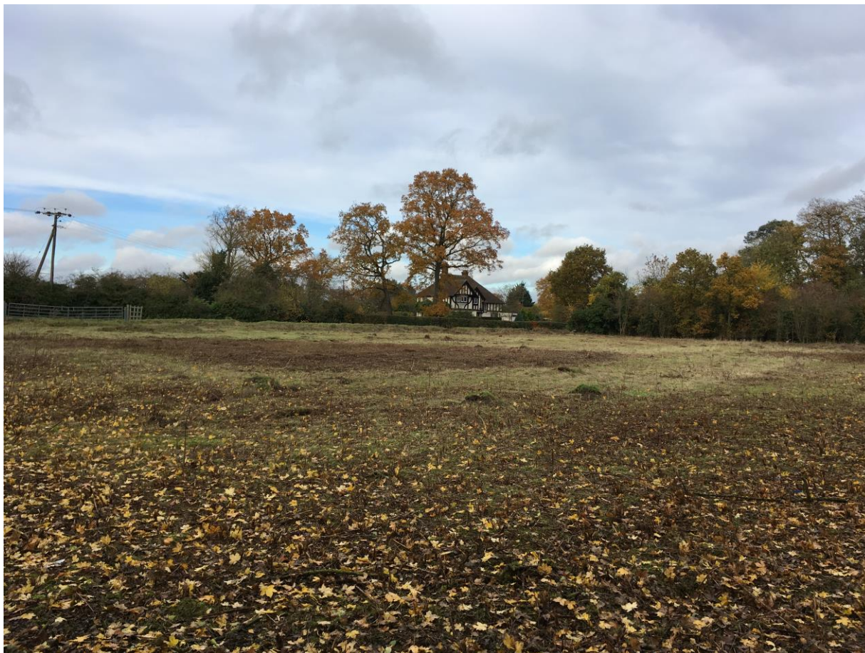
View from within the site looking north west