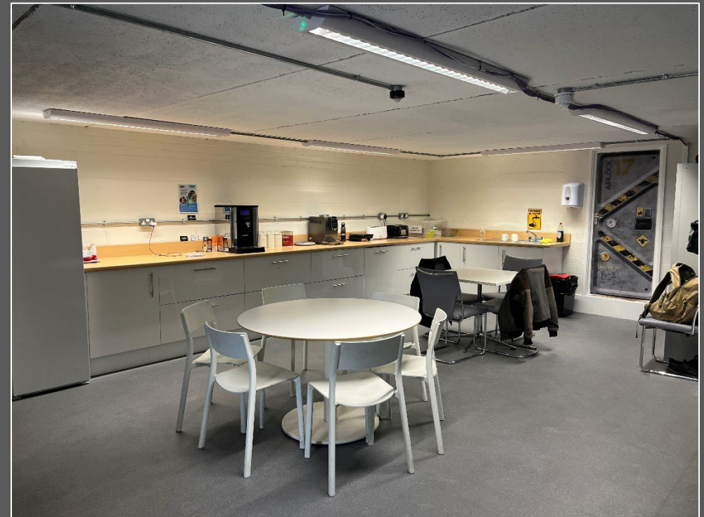
First floor workspace and kitchen