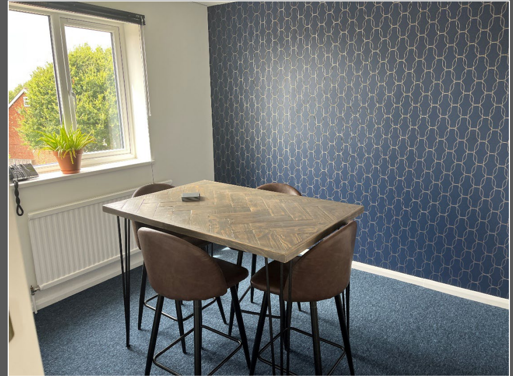
First floor offices