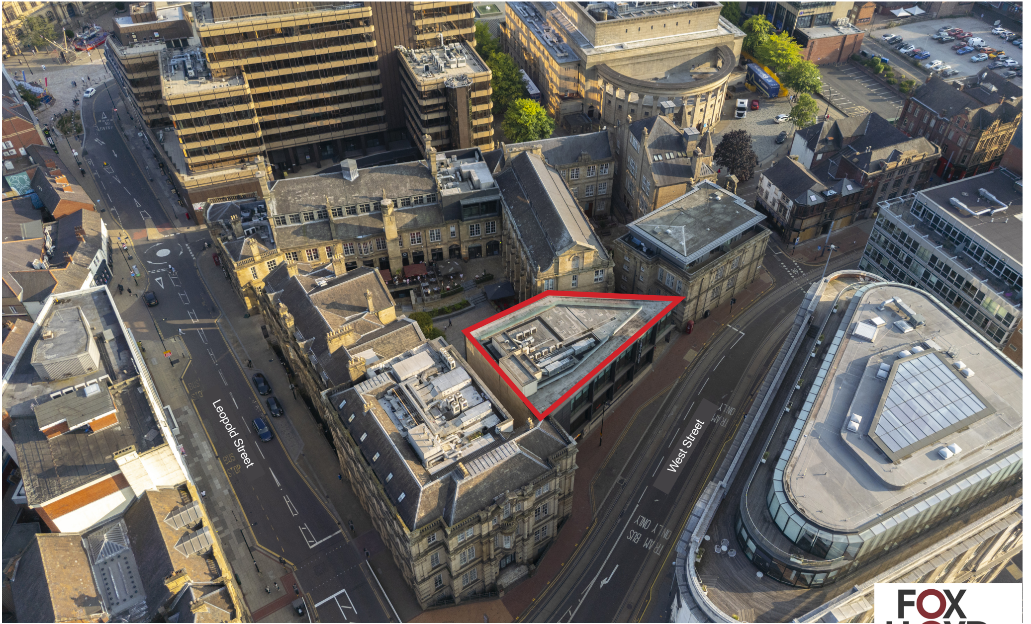
THE SHARD, LEOPOLD SQUARE, SHEFFIELD, S1 2JG