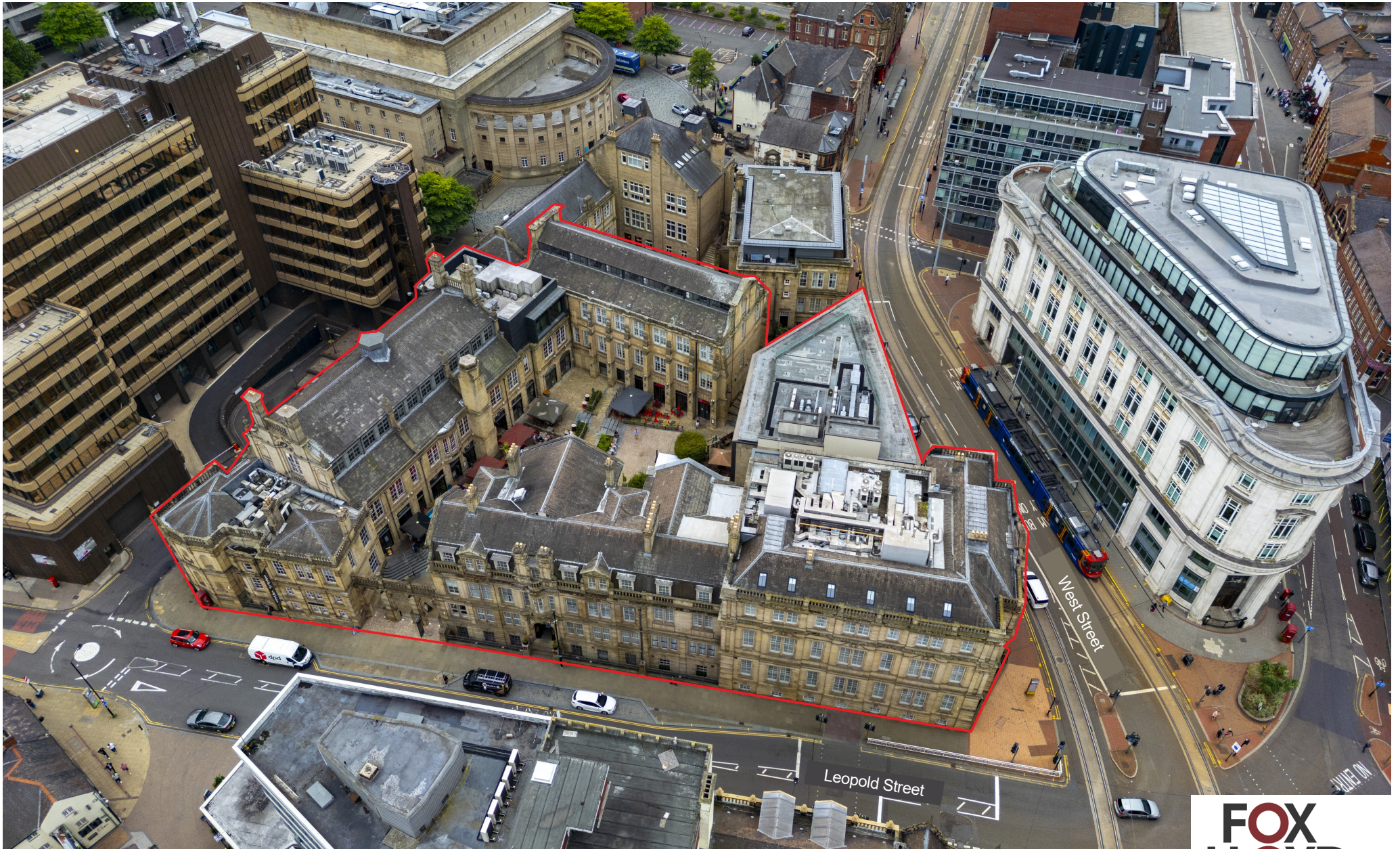
THE SHARD, LEOPOLD SQUARE, SHEFFIELD, S1 2JG