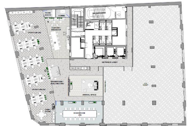
Cat B – Part Floor