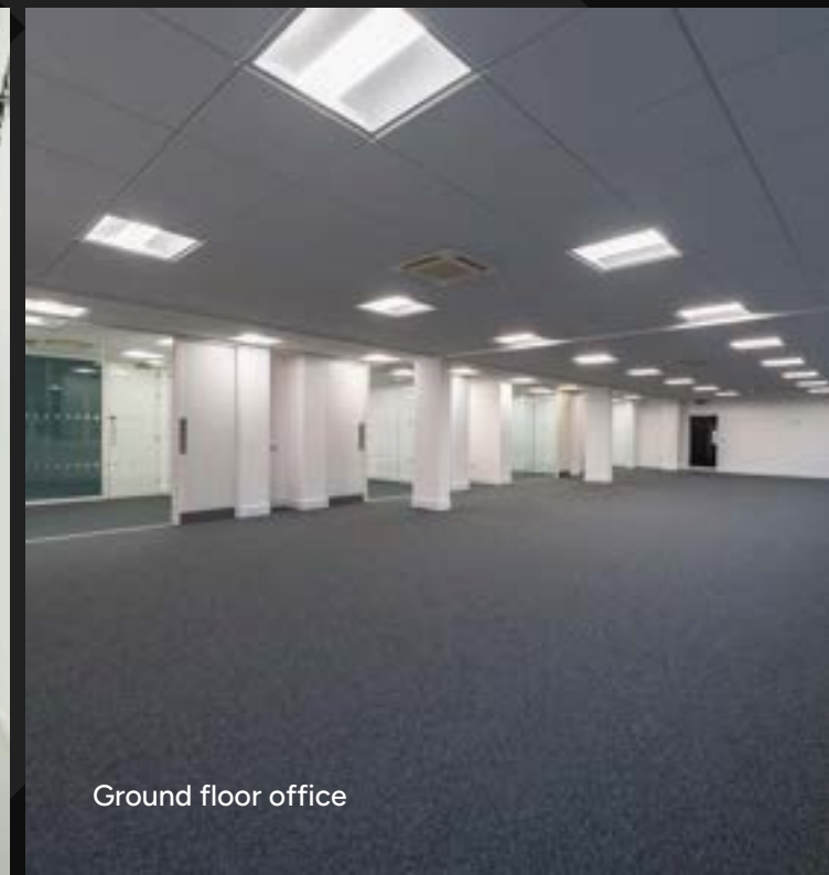
Ground floor office