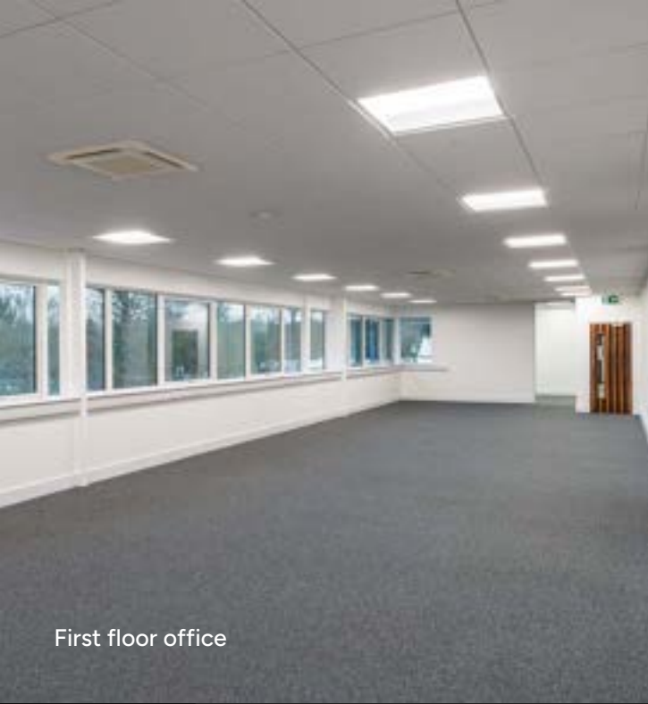
First floor office