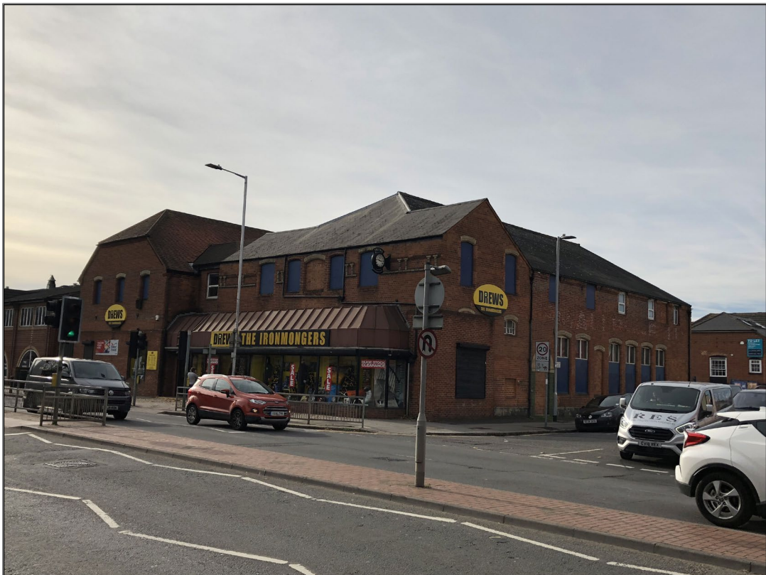
View of the property looking south west from Caversham Road