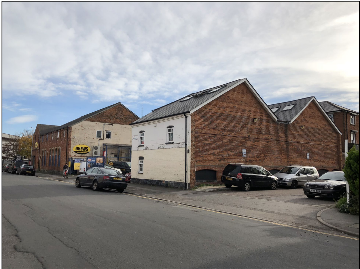
View of the property looking south east from Northfield Road