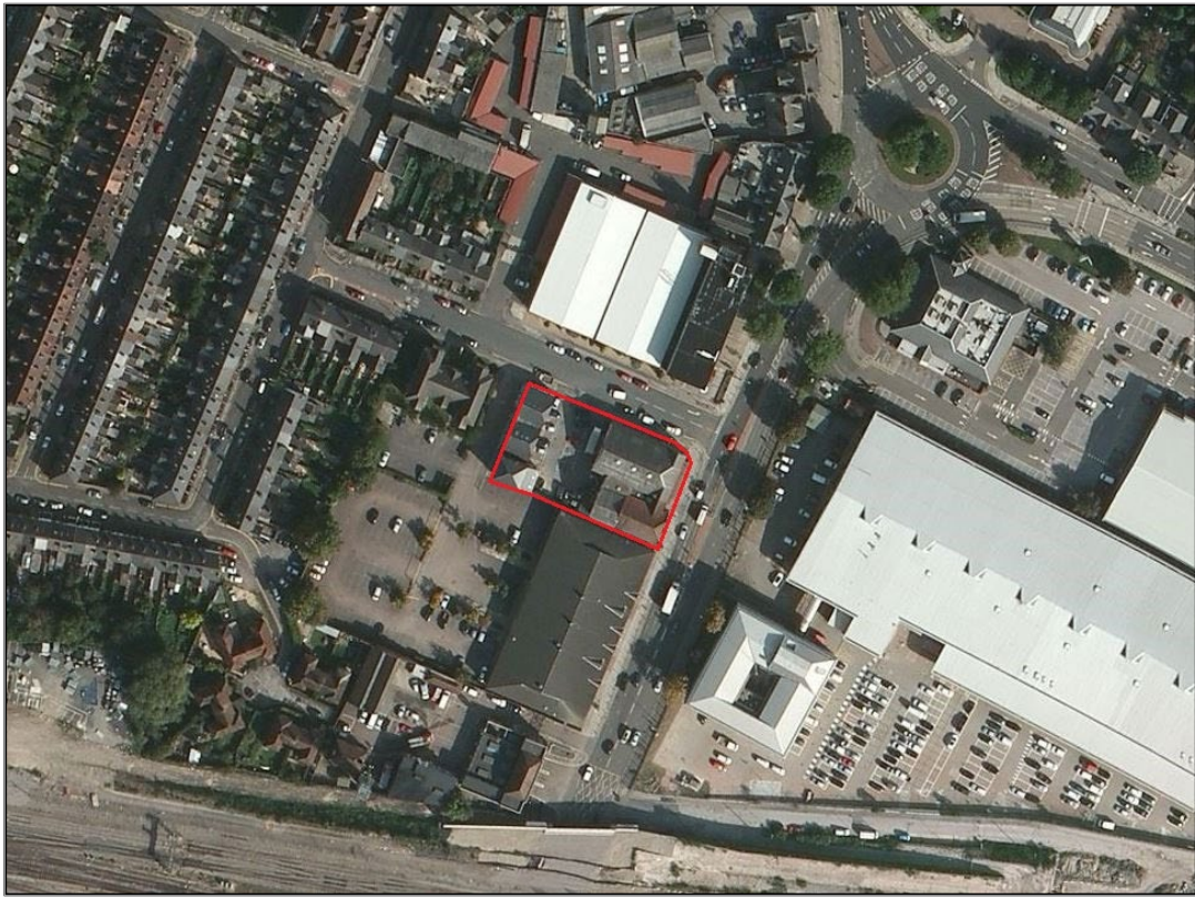
Aerial view of the property outlined in red