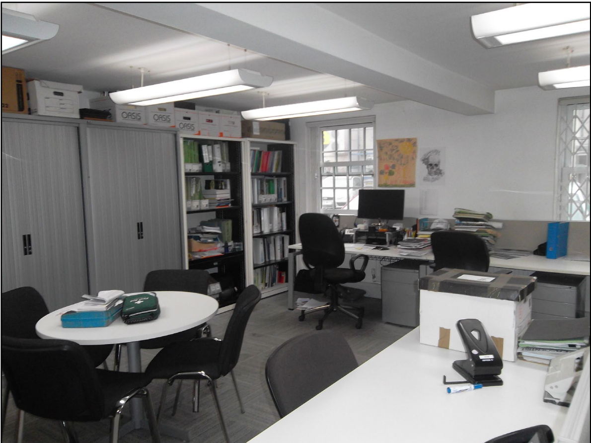
The Malthouse - Office Accommodation