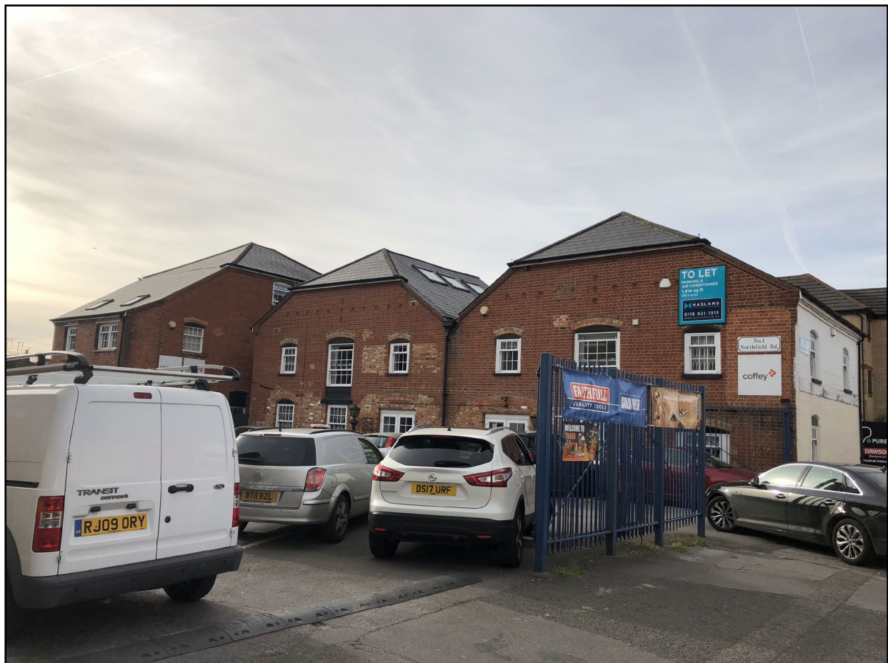
The Brewery and The Malthouse