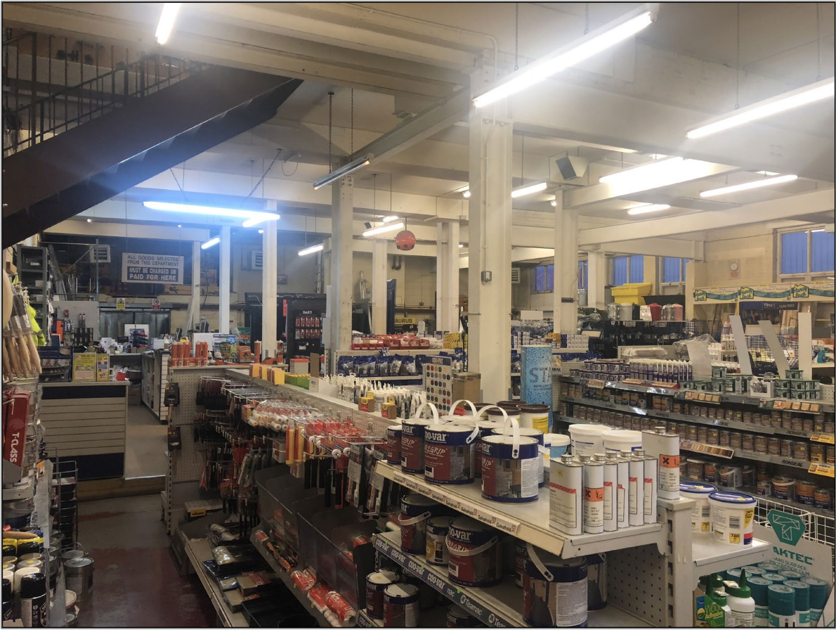
71-73 Caversham Road - Retail warehouse accommodation