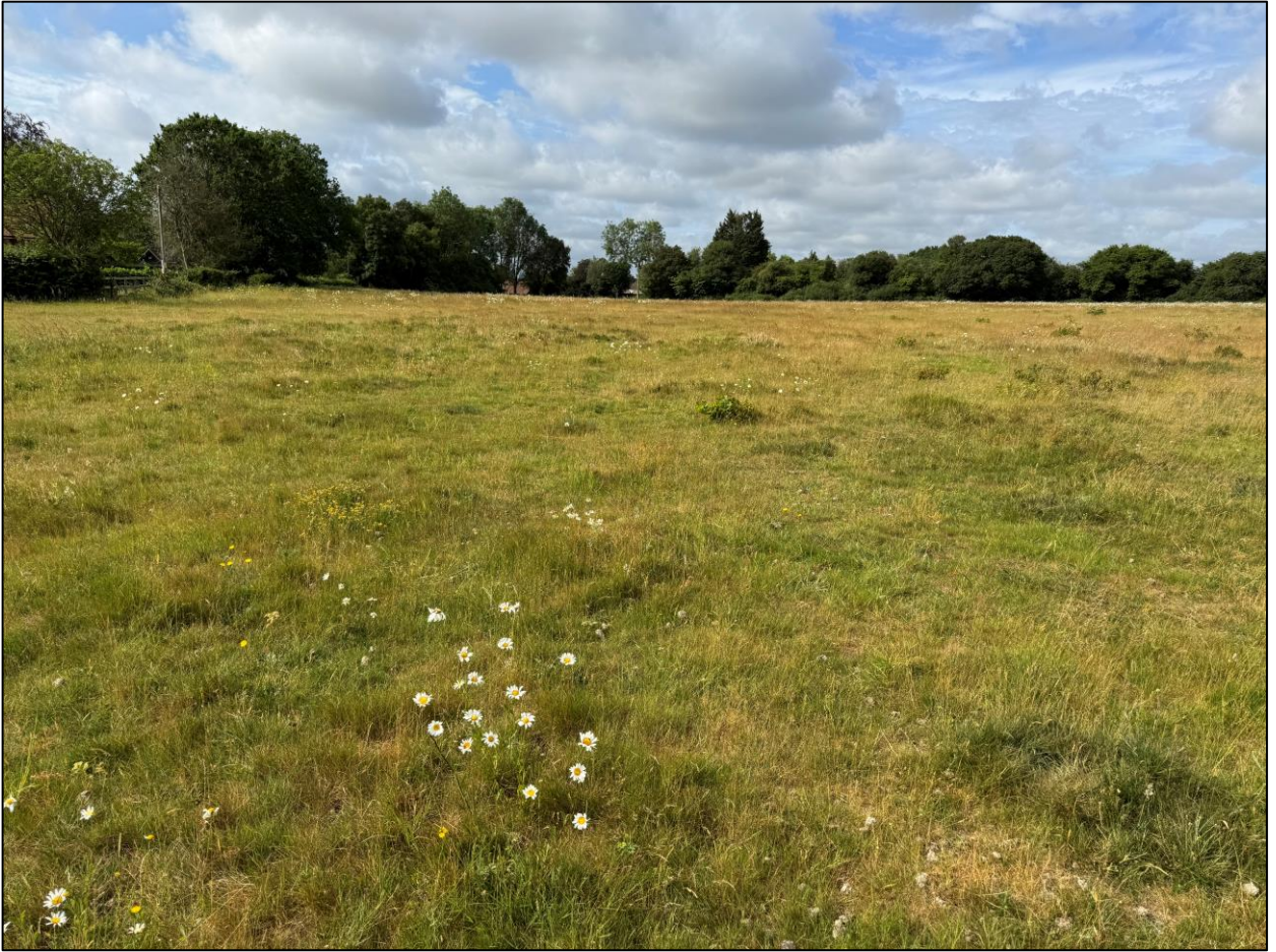
View from within Lot 1 looking southwest