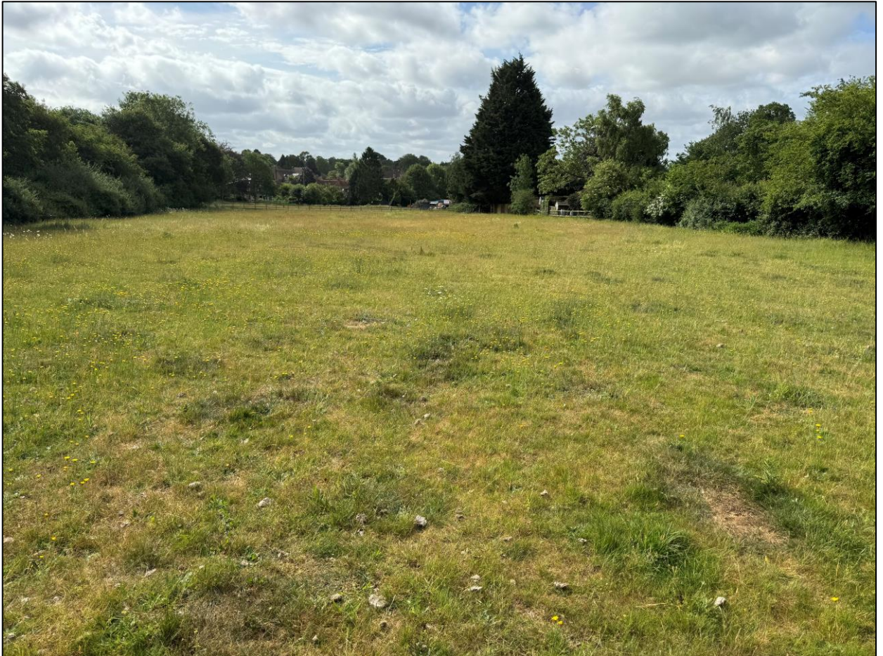
View from within Lot 2 looking southeast