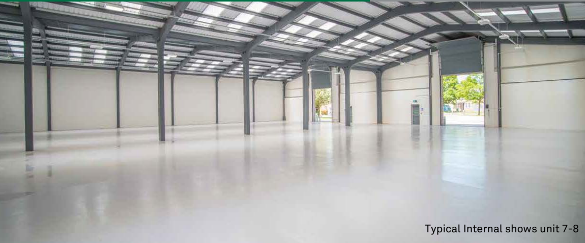
Typical Internal shows unit 7-8

Unit 2 is a self-contained unit with a large secure yard and parking area, scheduled for refurbishment.