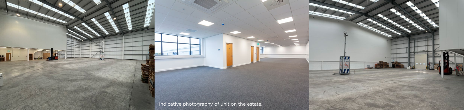
Indicative photography of unit on the estate.

Bradbury Park Industrial Estate · Bradbury Drive · Springwood Industrial Estate · Braintree · Essex · CM7 2ET