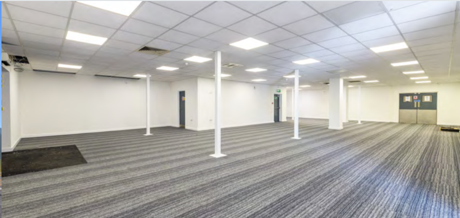
FIRST FLOOR OFFICES