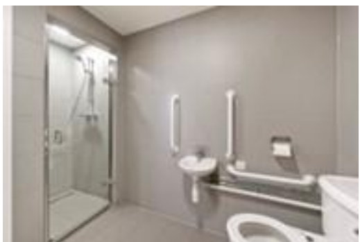
Shower and bathroom