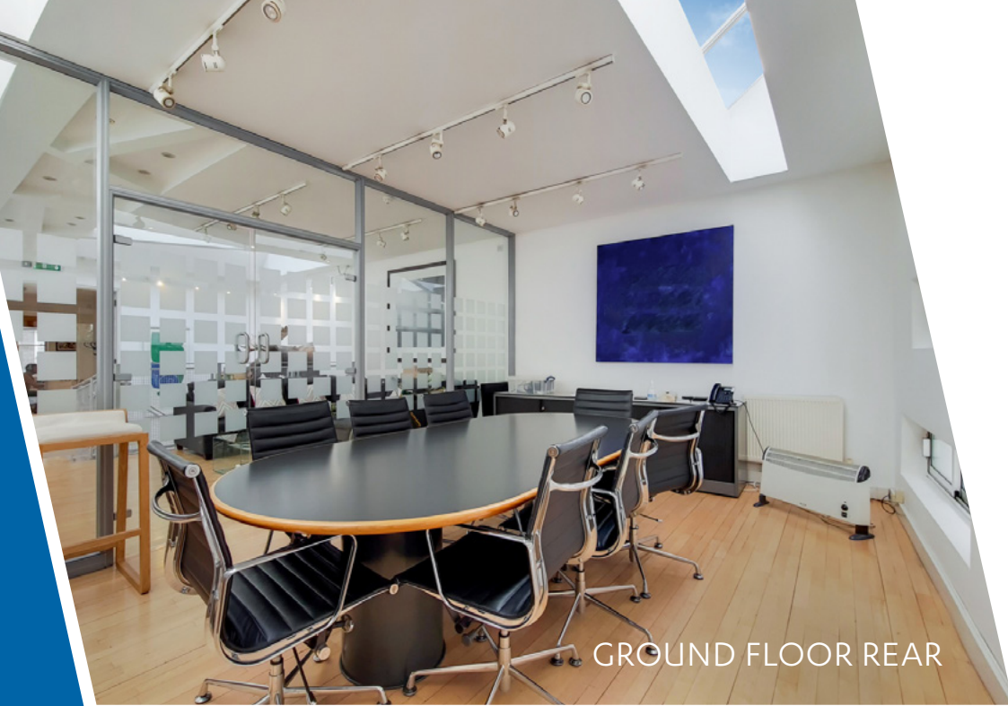
GROUND FLOOR REAR