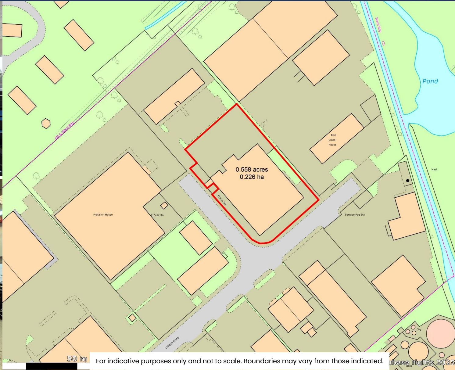
For indicative purposes only and not to scale. Boundaries may vary from those indicated.