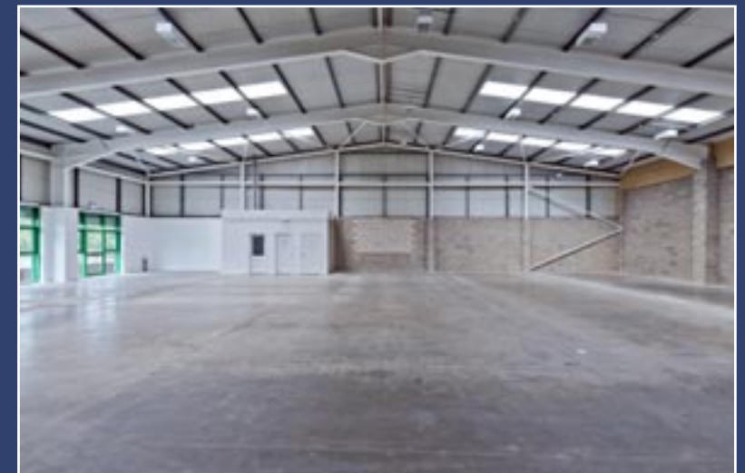
To be refurbished - Example of refurbished building