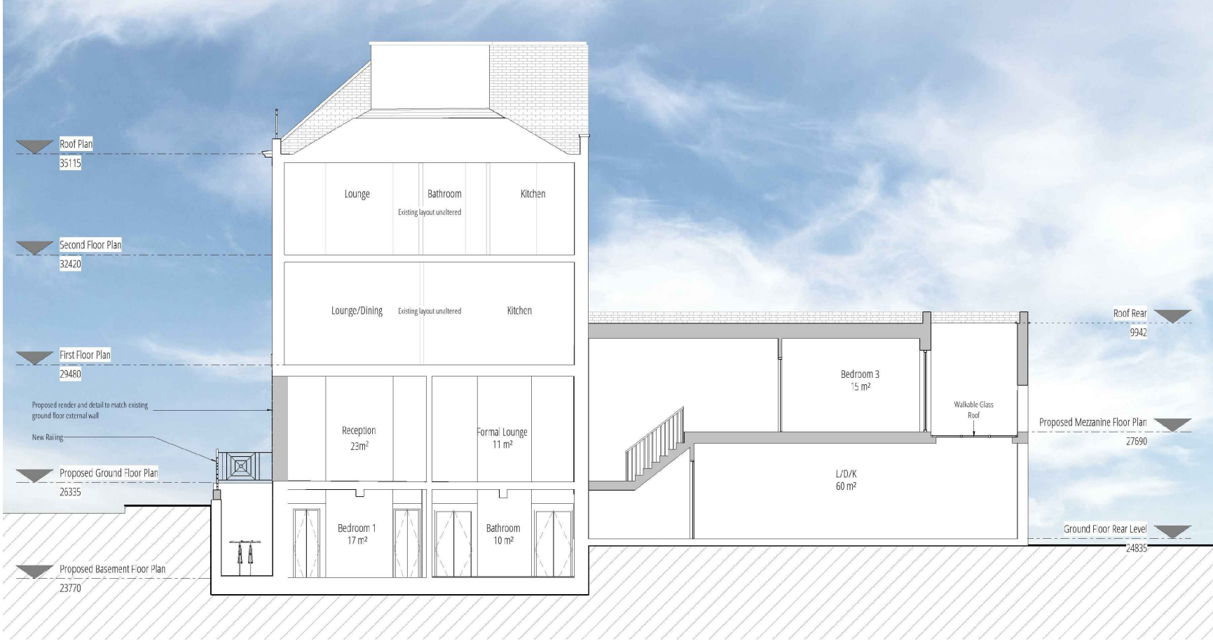
1 Proposed Section EE' 1 : 100

NOTES: 1. THIS DRAWING IS COPYRIGHT AND MUST NOT BE REPRODUCED IN WHOLE OR IN PART WITHOUT WRITTEN PERMISSION OF GAA DESIGN. 2. THIS DRAWING REPRESENTS DESIGN INTENT AND CONCEPT ONLY. HENCE IT CAN BE SCALED FOR PLANNING PURPOSES ONLY. 3. THIS DOCUMENT AND ALL ASSOCIATED DOCUMENTS ARE PREPARED FOR SPECIFIC SITE AND SCHEME AND INCORPORATE CALCULATIONS AND ASSUMPTIONS AVAILABLE FROM THE CLIENT AT THE TIME OF DRAFTING. 4. THE RECIPIENT AGREES TO PROTECT THE CONTENTS FROM DISSEMINATION AND DISSEMINATION EXCEPT AS REQUIRED FOR THE SPECIFIC CLIENT NAMED, WITHOUT THE WRITTEN PERMISSION OF THE DESIGNER. 5. USE OF THIS DESIGN IS GRANTED TO THE CLIENT FOR THE SPECIFIC AND NAMED EVENT ONLY. COPYRIGHT © 2019