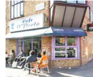
H Cafe O'Porto