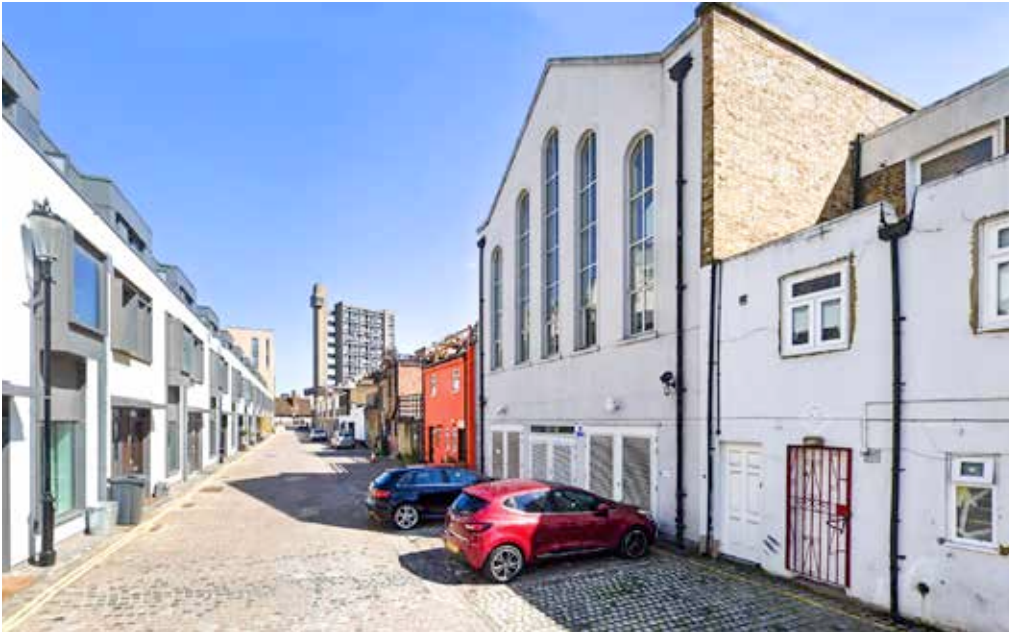
rear mews entrance & parking