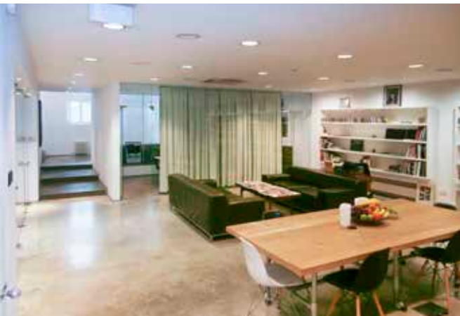
ground floor break out area