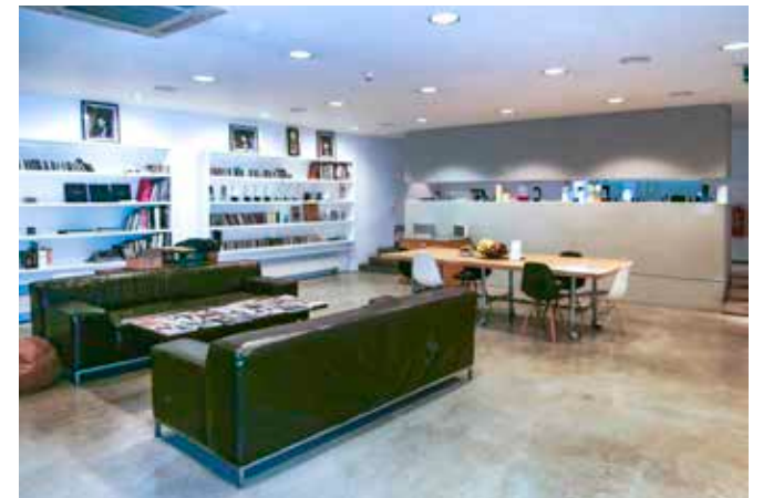
ground floor kitchen & break out area