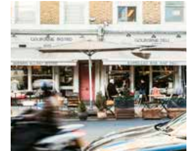
C Goldborne Deli