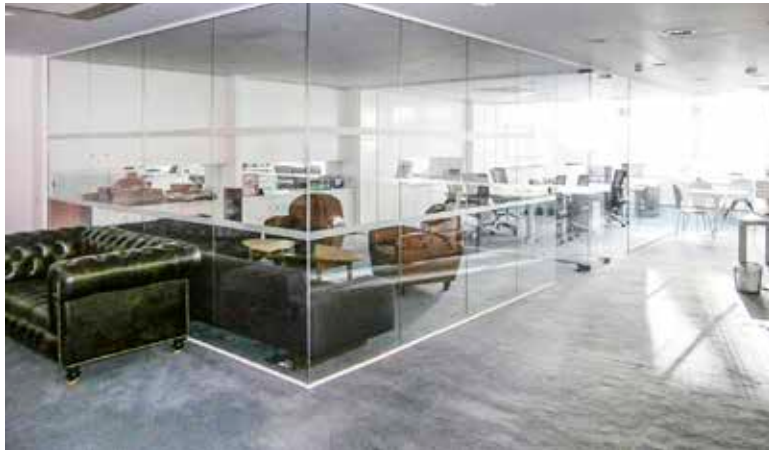
ground floor & meeting room