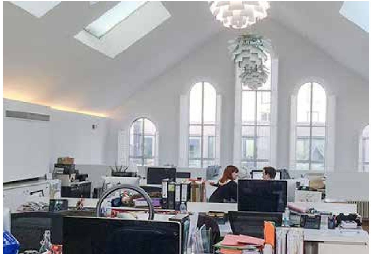
first floor office area