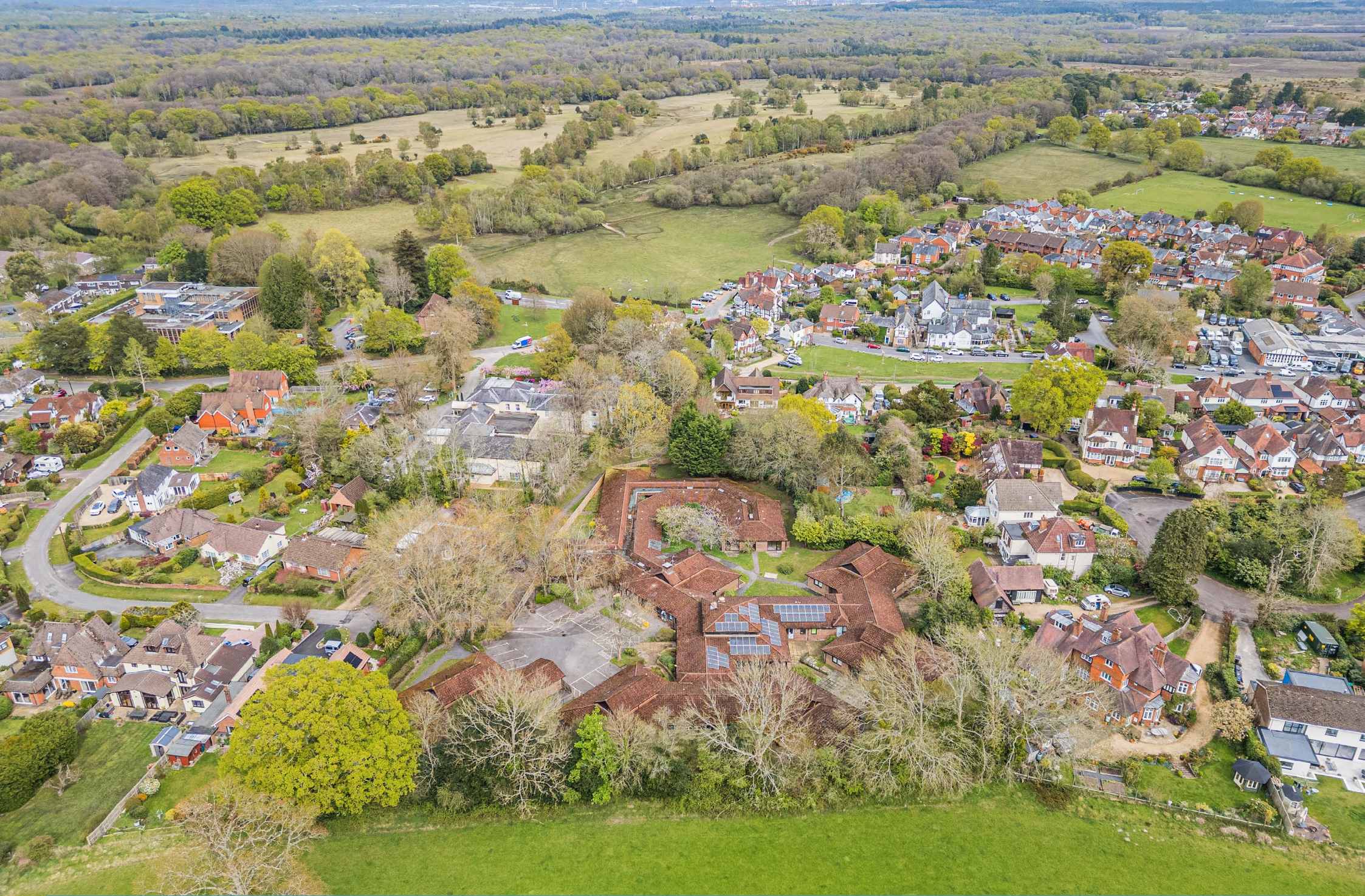
CRANLEIGH PADDOCK , CALPE AVENUE, LYNDBURST, HAMPSHIRE, SO43 7AT