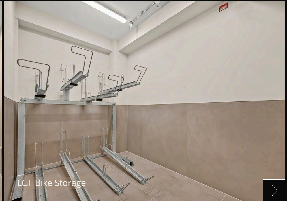
LGF Bike Storage