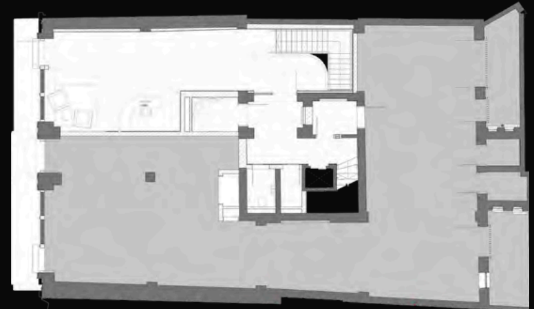
GROUND FLOOR | 1,776 SQFT

Please note there is xxx sq. ft. of newly refurbished state of the art office above. For more information please speak to a member of the team.