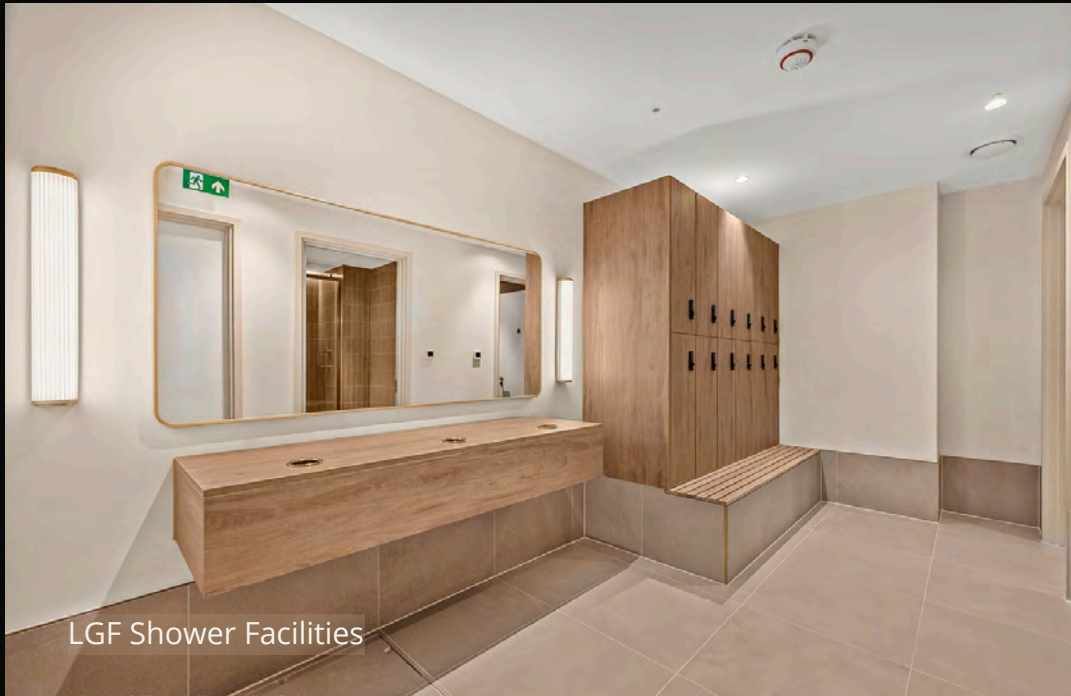
LGF Shower Facilities