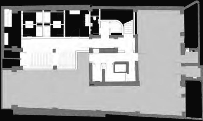
LOWER GROUND FLOOR | 1,636 SQFT