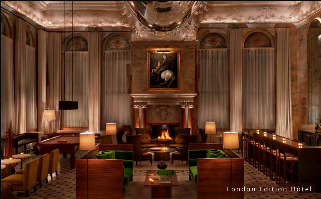
London Edition Hôtel