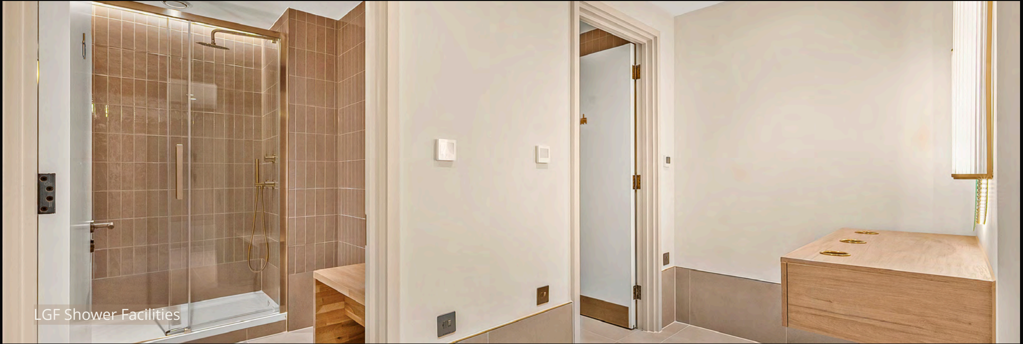
LGF Shower Facilities