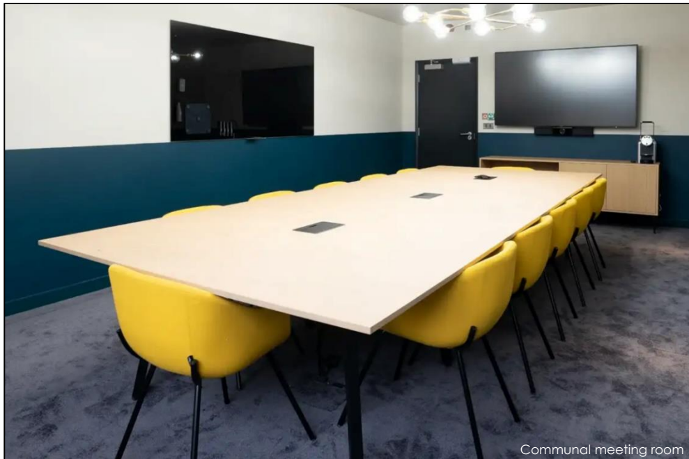
Communal meeting room