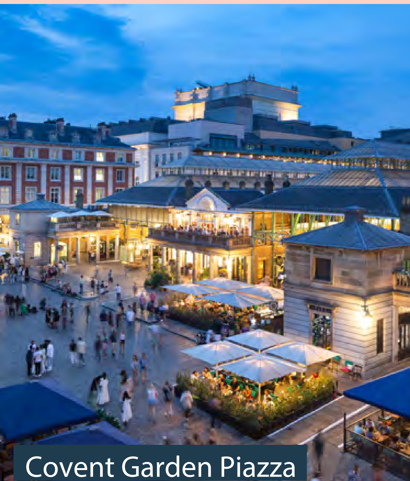
Covent Garden Piazza