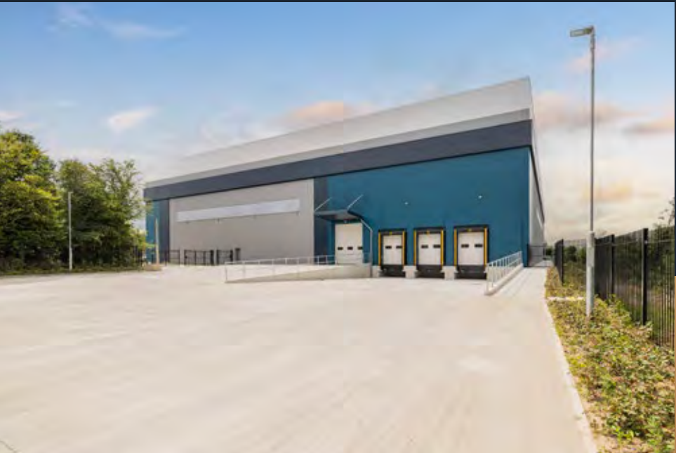
Striking Corporate Logistics HQ

Intending tenants are specifically advised to verify all information, including floor and site areas. See DISCLAIMER.