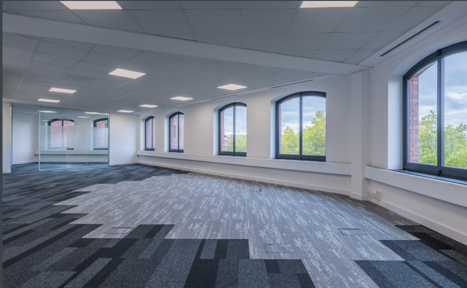
Part 4th Floor 3,465 sq ft (322 sq m)