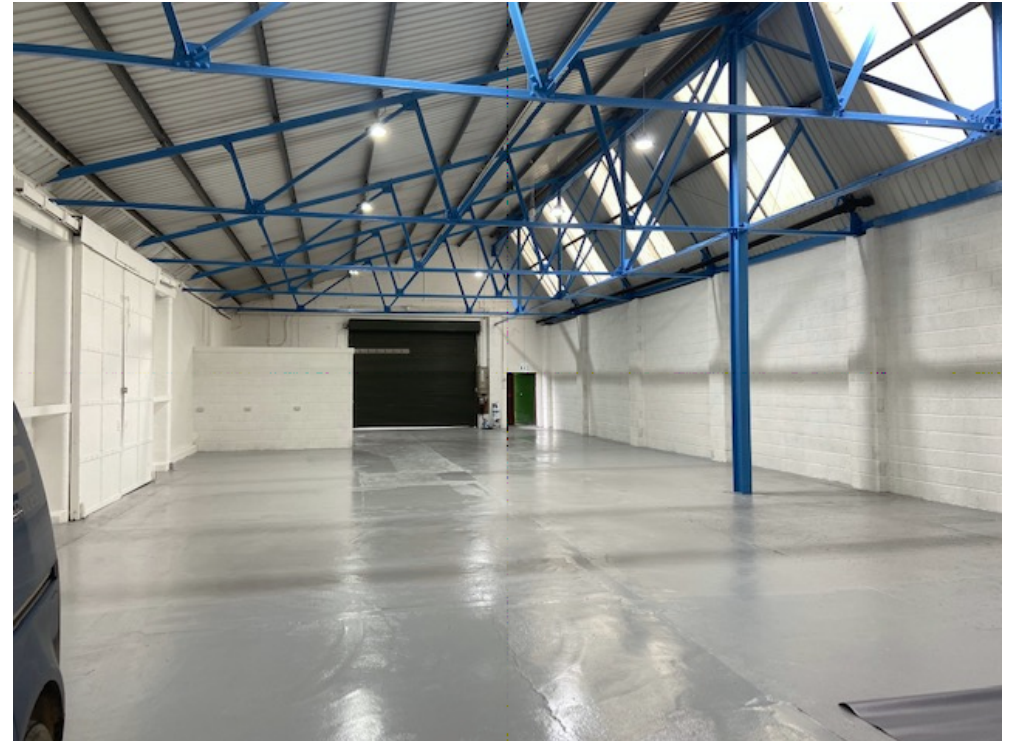
Typical Unit - office content varies and can be built to suit

For viewings and further information, please contact: