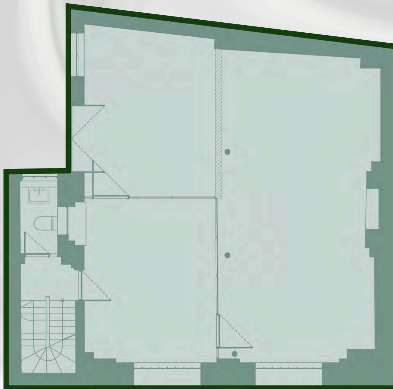
FIRST 659 SQ.FT

Not to scale. For indicative purposes only.