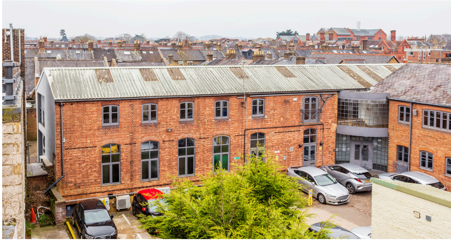
View of the site from Victoria Street Car Park (facing south) Photos and maps for indicative purposes only