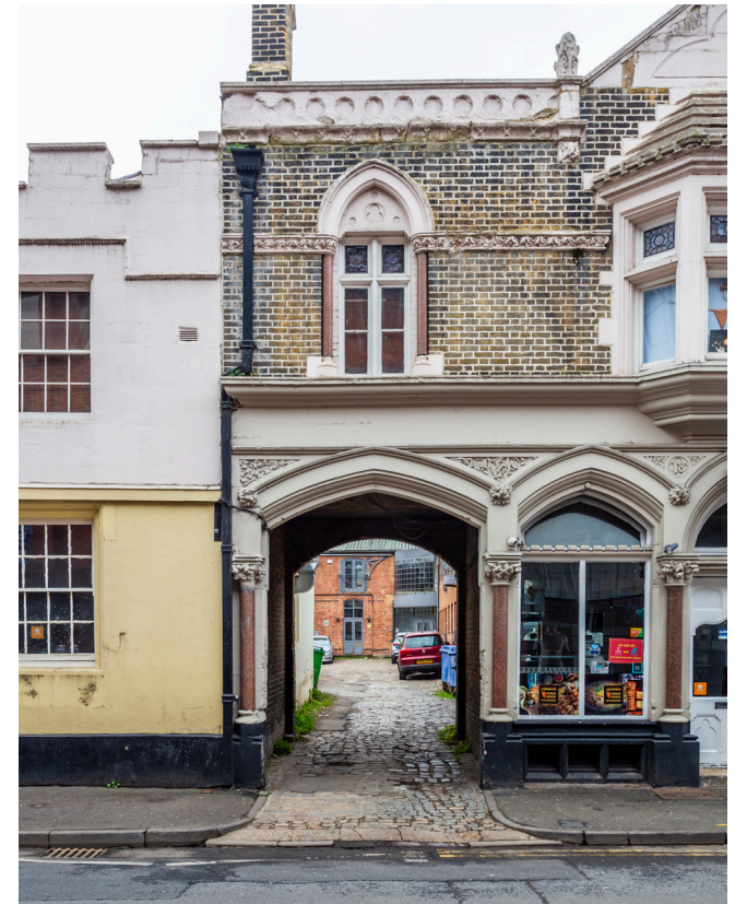
Site entrance from Victoria Street (facing south) All maps, photographs & plans are for indicative purposes only