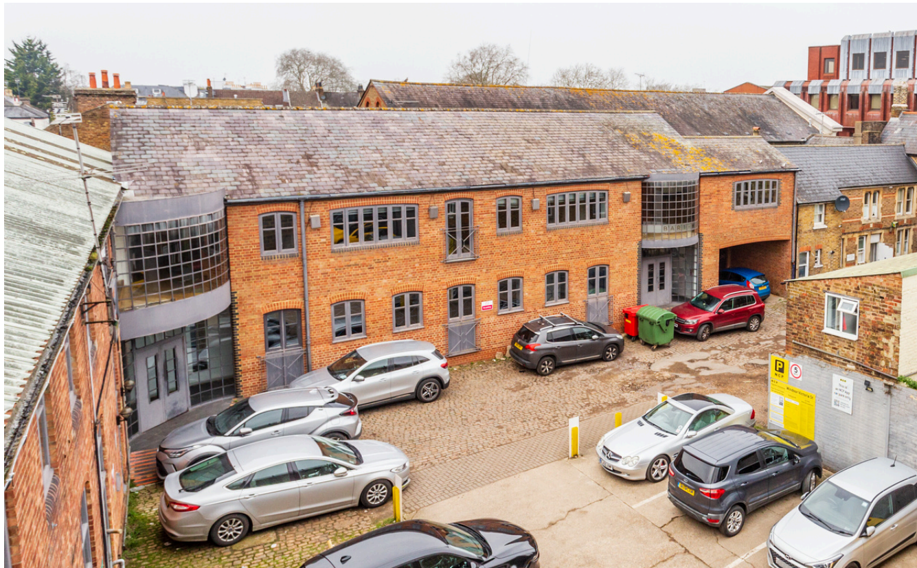
View of the site from Victoria Street Car Park (facing northwest)