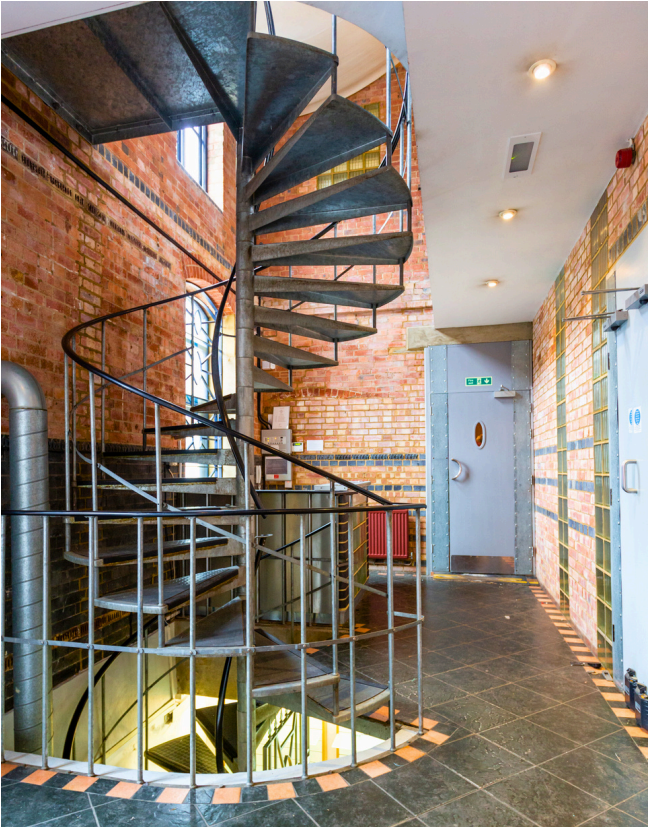
Internal spiral staircase