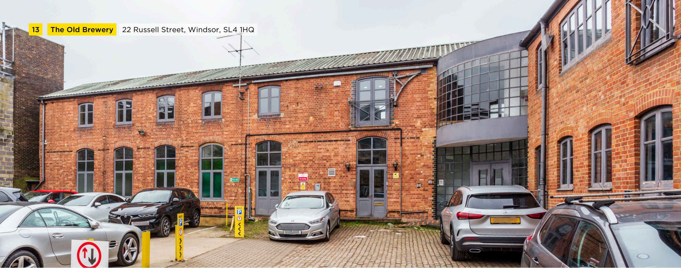
Site facing south, for indicative purposes only