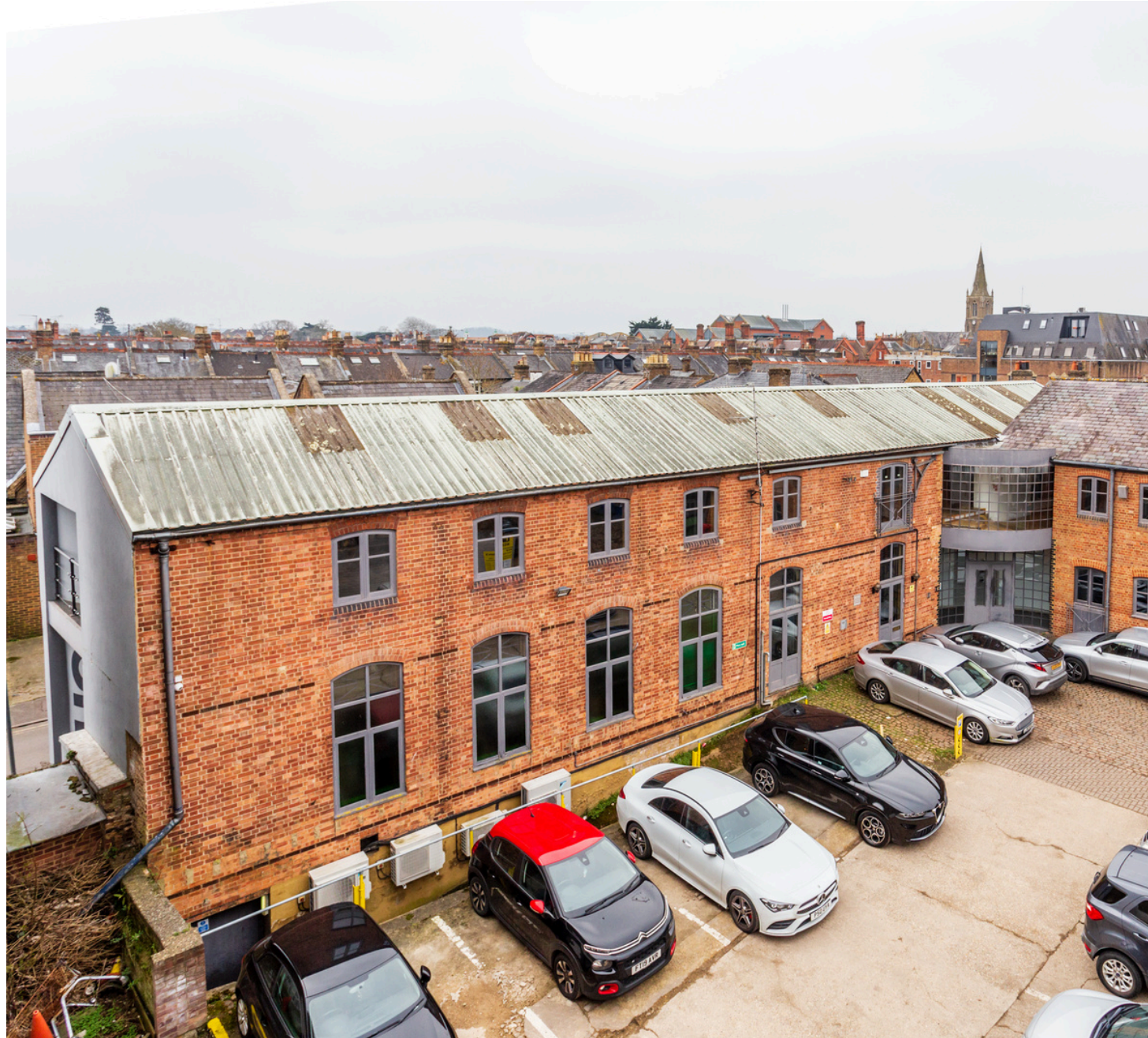
View from Victoria Street Car Park facing southwest (for indicative purposes only)

Please note that each bidding party may be required to provide proof of funds in support of their offer.