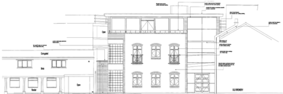
Elevation showing previously granted side story extension (indicative only).

Historically, an architect has provided drawings for a residential development and these can be found in the data room. Please note these drawings are for illustrative purposes only and cannot be relied upon.