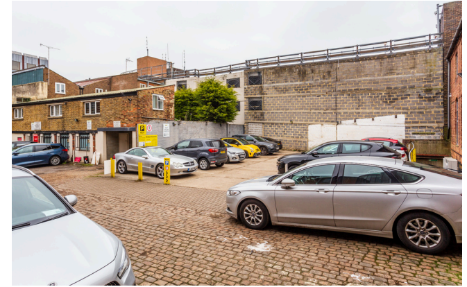
Courtyard and car park area (northeast)