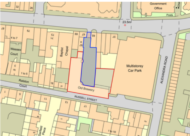
OS Redline Plan of the ownership, for indicative purposes only

The property includes 16 parking spaces, with 12 spaces currently leased to NCP.