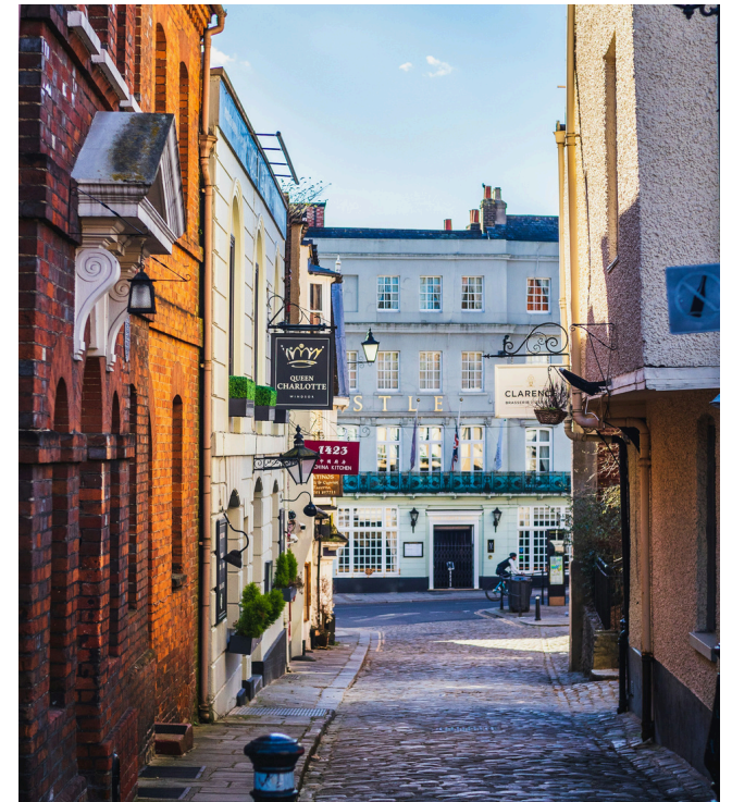
Photographs of Windsor Castle, Old Windsor Bridge and Church Lane, (for indicative purposes only)