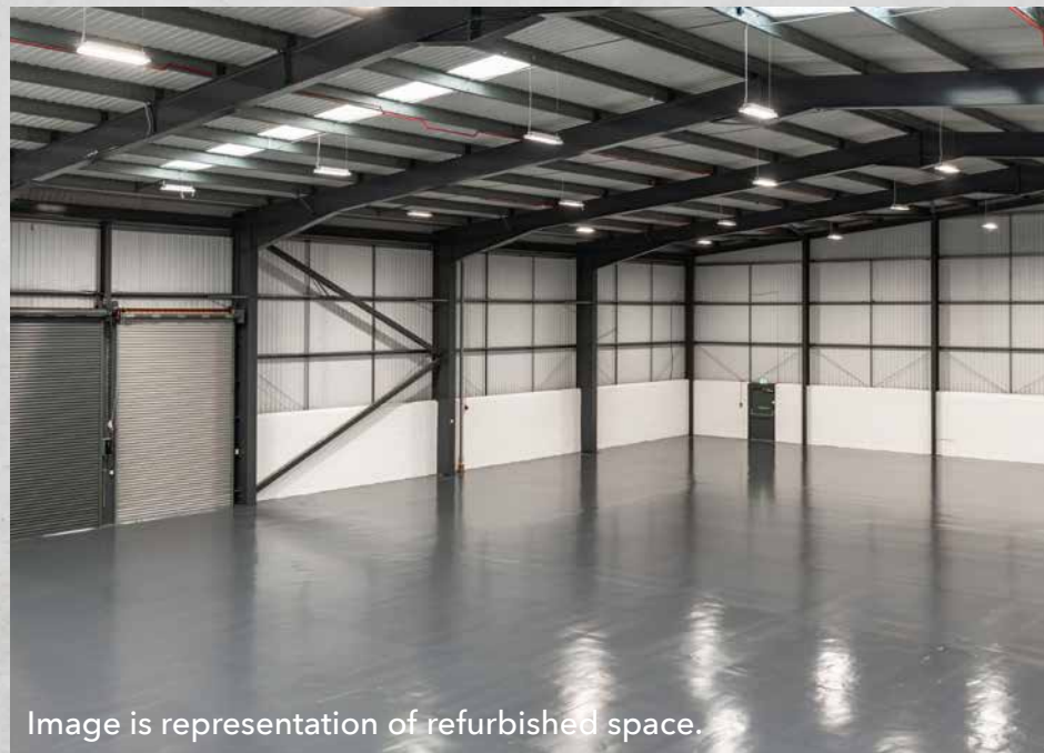
Image is representation of refurbished space.