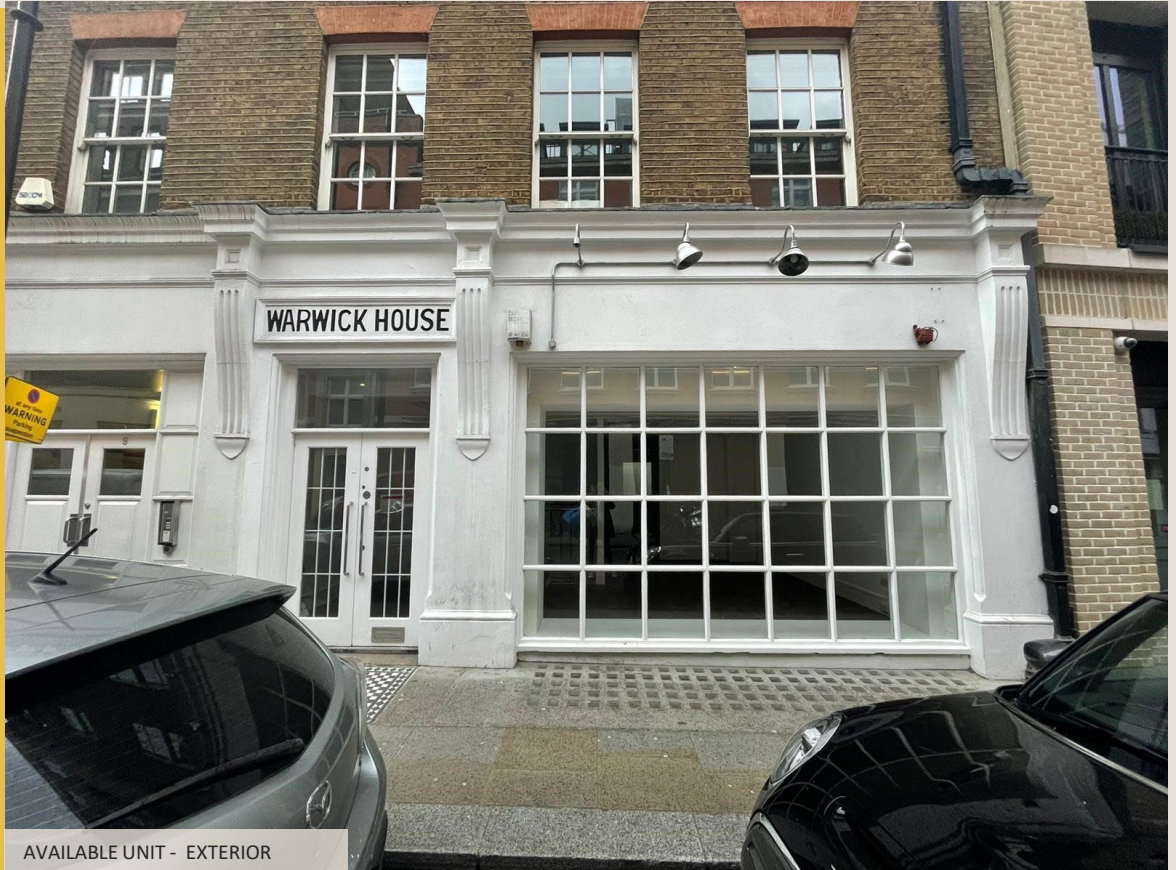
AVAILABLE UNIT - EXTERIOR