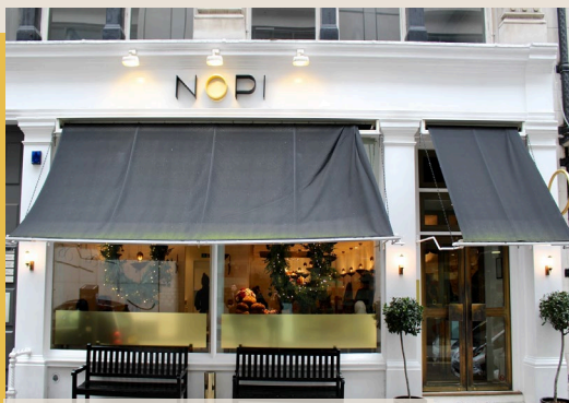
OTTOLENGHI NOPI – WARWICK STREET