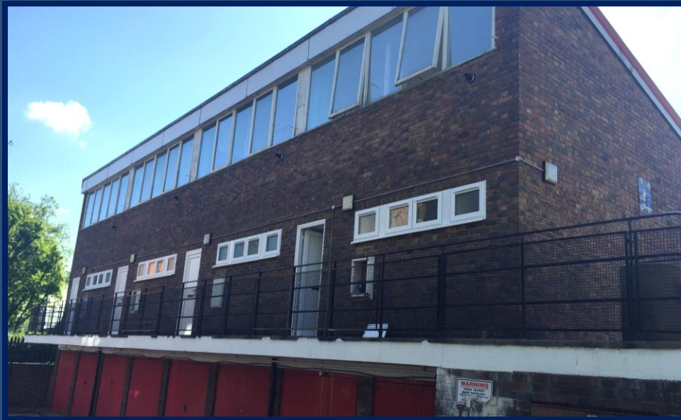
Image of Stanley Bridge Studios

Studios of Approx. 300 sq ft (27.87 sq m) including mezzanine