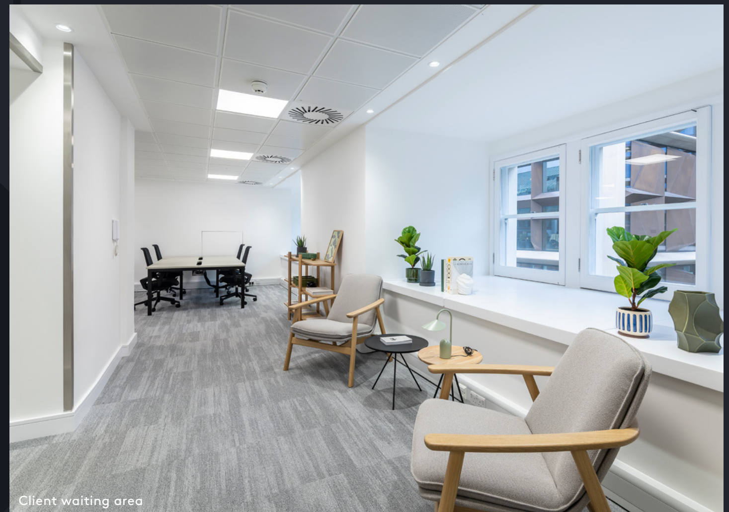
Client waiting area