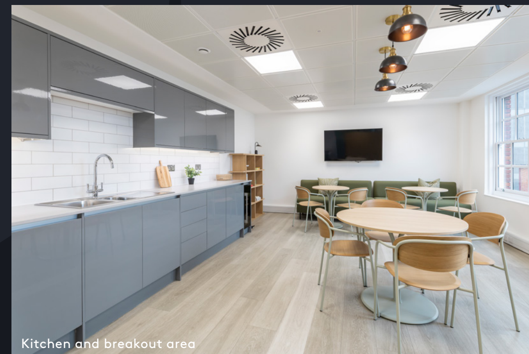
Kitchen and breakout area