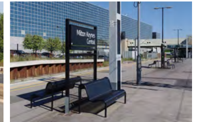
Milton Keynes Central - 3 miles

DISCLAIMER: The Agents for themselves and for the vendors or lessors of the property whose agents they are give notice that, (i) these particulars are given without responsibility of The Agents or the Vendors or Lessors as a general outline only, for the guidance of prospective purchasers or tenants, and do not constitute the whole or any part of an offer or contract; (ii) The Agents cannot guarantee the accuracy of any description, dimension, references to condition, necessary permissions for use and occupation and other details contained herein and any prospective purchasers or tenants should not rely on them as statements or representations of fact but must satisfy themselves by inspection or otherwise as to the accuracy of each of them; (iii) no employee of The Agents has any authority to make or give any representation or enter into any contract whatsoever in relation to the property; (iv) VAT may be payable on the purchase price and / or rent, all figures are exclusive of VAT, intending purchasers or lessees must satisfy themselves as to the applicable VAT position, if necessary by taking appropriate professional advice; (v) The Agents will not be liable, in negligence or otherwise, for any loss arising from the use of these particulars. 10.16.