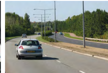
Direct and easy access to M1 and A5