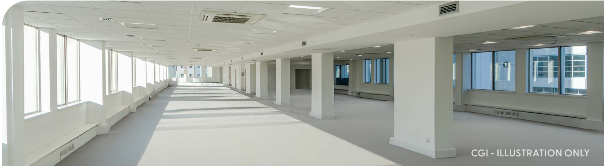
CGI - ILLUSTRATION ONLY