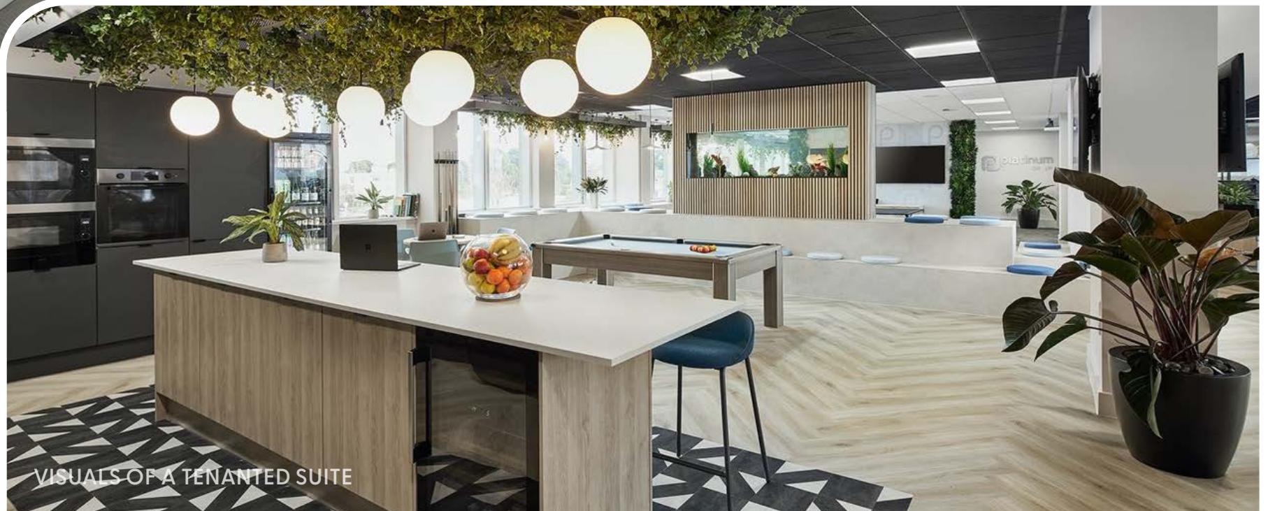
VISUALS OF A TENANTED SUITE