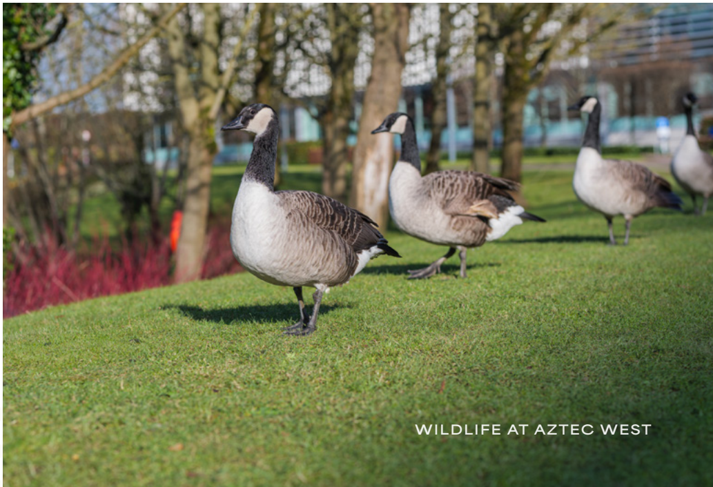
WILDLIFE AT AZTEC WEST