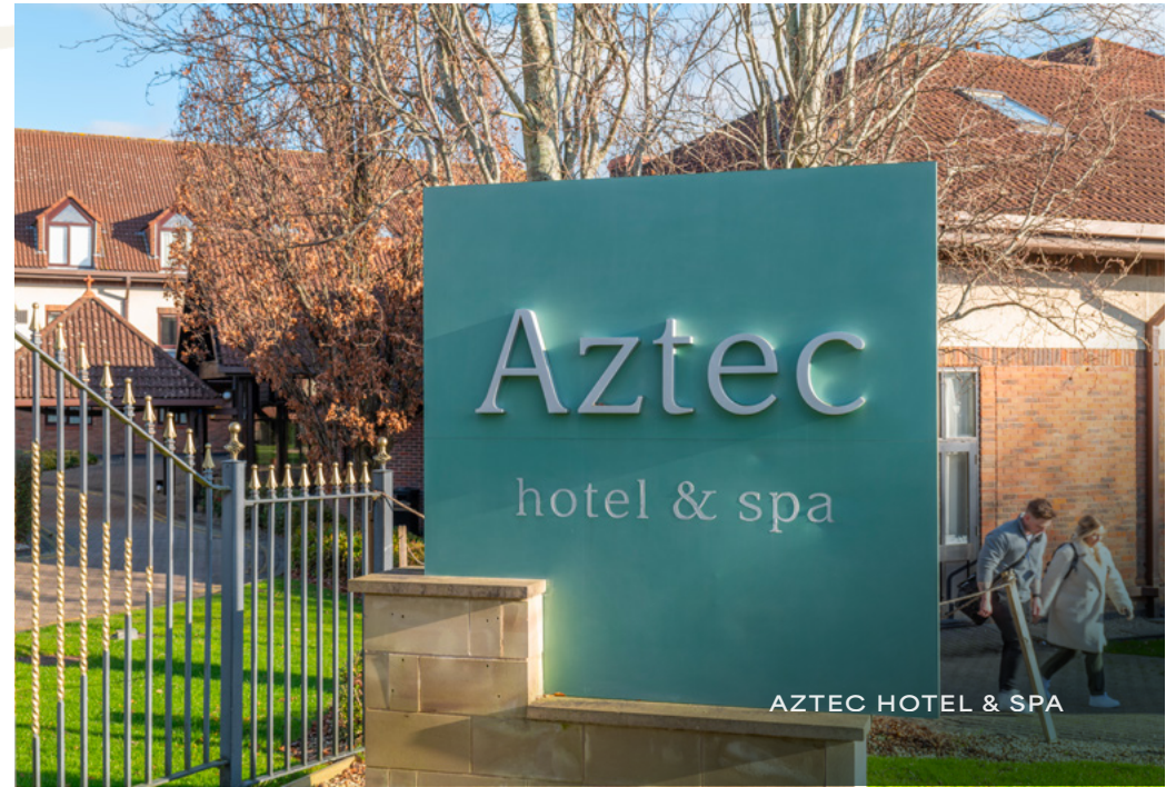
AZTEC HOTEL & SPA