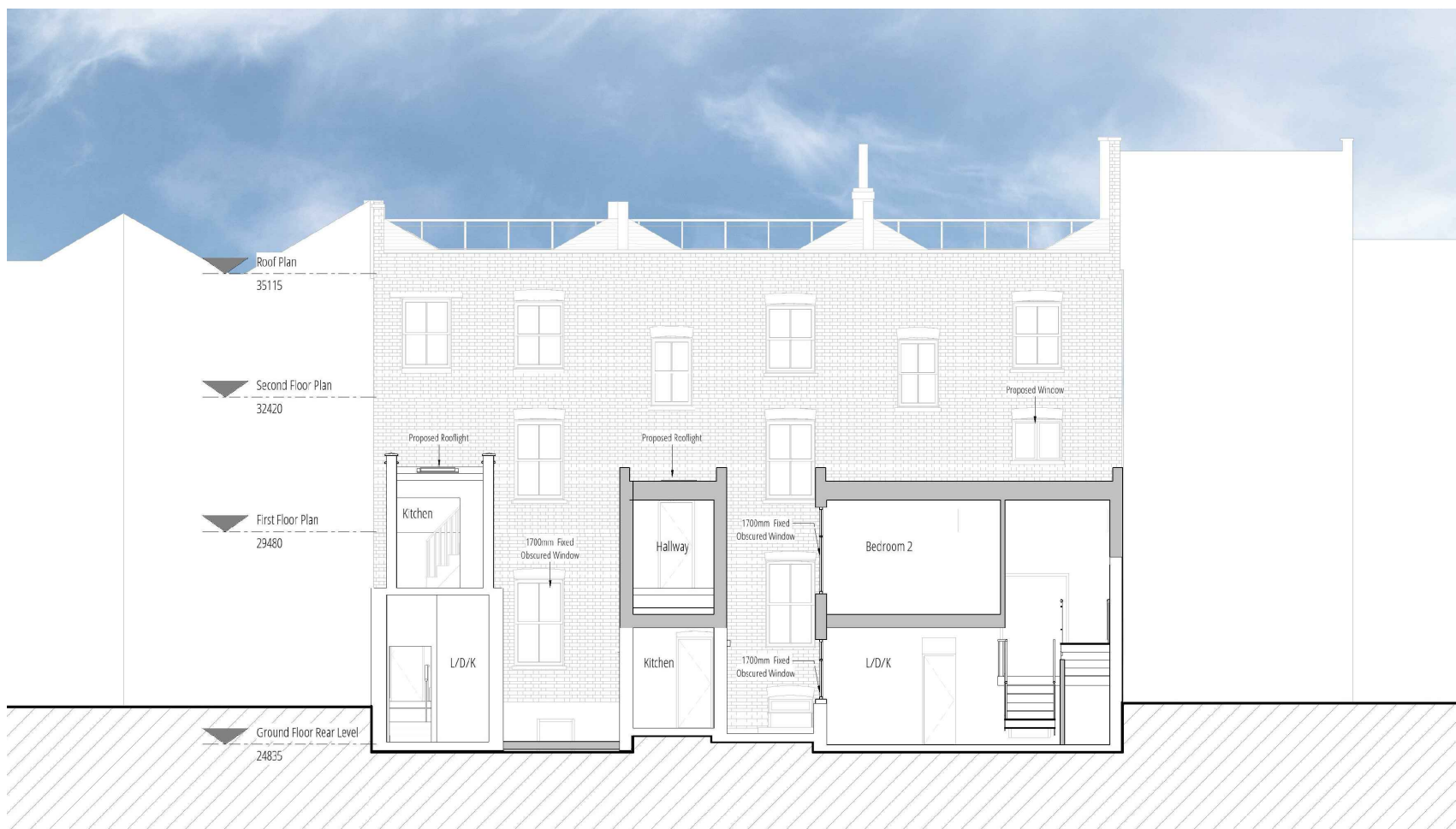
1 Proposed Section AA' 1:100

NOTES: 1. THIS DRAWING IS COPYRIGHT AND MUST NOT BE REPRODUCED IN WHOLE OR IN PART WITHOUT WRITTEN PERMISSION OF GAA DESIGN. 2. THIS DRAWING REPRESENTS DESIGN INTENT AND CONCEPT ONLY. HENCE IT CAN BE SCALED FOR PLANNING PURPOSES ONLY. 3. THIS DOCUMENT AND ALL ASSOCIATED DOCUMENTS ARE PREPARED FOR SPECIFIC SITE AND SCHEME AND INCORPORATE CALCULATIONS AND REQUIREMENTS AVAILABLE FROM THE CLIENT AT THE TIME OF DRAFTING. 4. THE RECIPIENT AGREES TO PROTECT THE CONTENTS FROM DISSEMINATION AND DISSEMINATION EXCEPT AS REQUIRED FOR THE SPECIFIC CLIENT NAMED, WITHOUT THE WRITTEN PERMISSION OF THE DESIGNER. 5. USE OF THIS DESIGN IS GRANTED TO THE CLIENT FOR THE SPECIFIC AND NAMED EVENT ONLY. COPYRIGHT © 2019