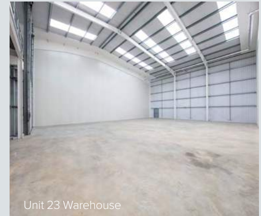
Unit 23 Warehouse