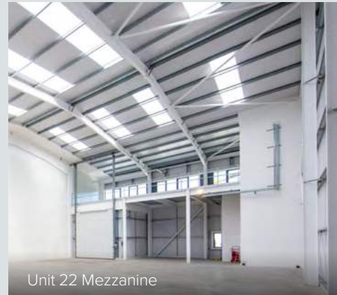
Unit 22 Mezzanine

The unit is available to lease on terms to be agreed.