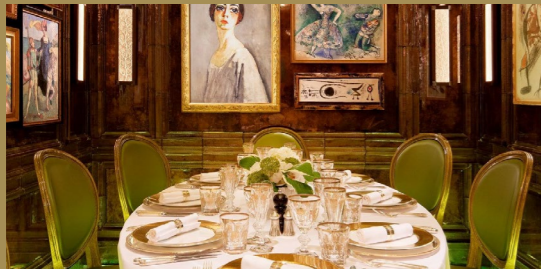
RESTAURANT Le Gavroche

Uncover the wide range of social spots throughout this area and some of One Avenue's brand partnerships that you and your employees would have access to.