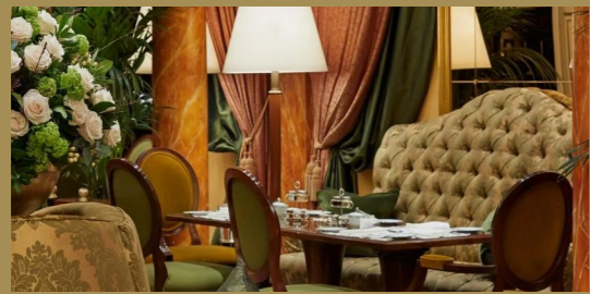
ENTERTAINMENT London Marriott Hotel