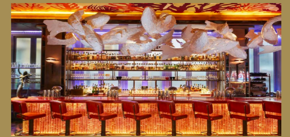
RESTAURANT Sexy Fish