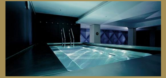
WELLNESS Virgin Active