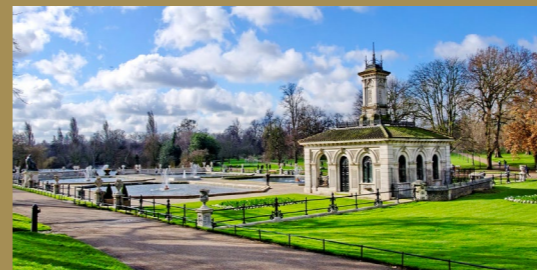
ENTERTAINMENT Hyde Park