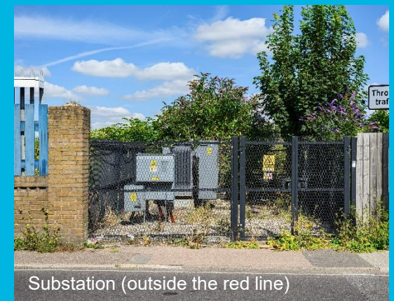
Substation (outside the red line)