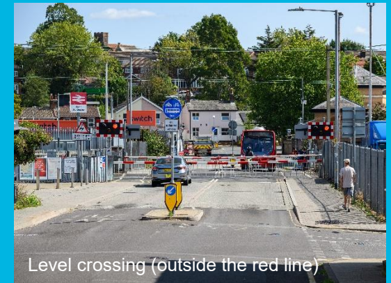
Level crossing (outside the red line)