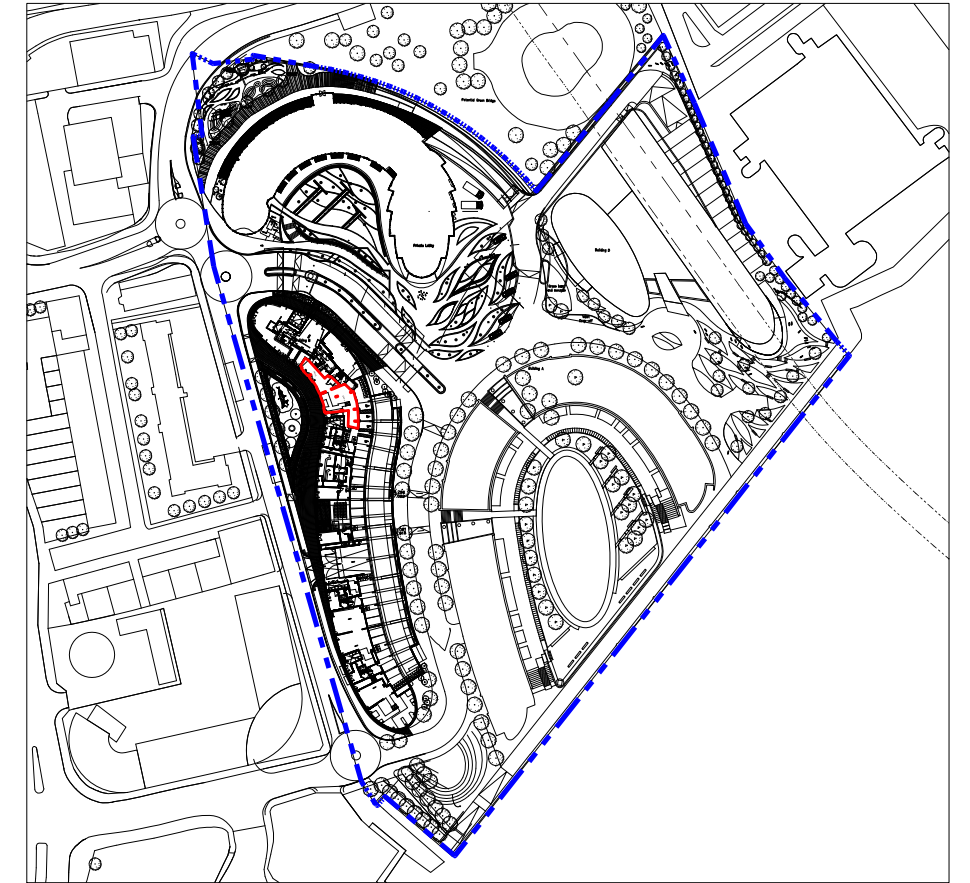
LOCATION PLAN SCALE ( 1: 2500)