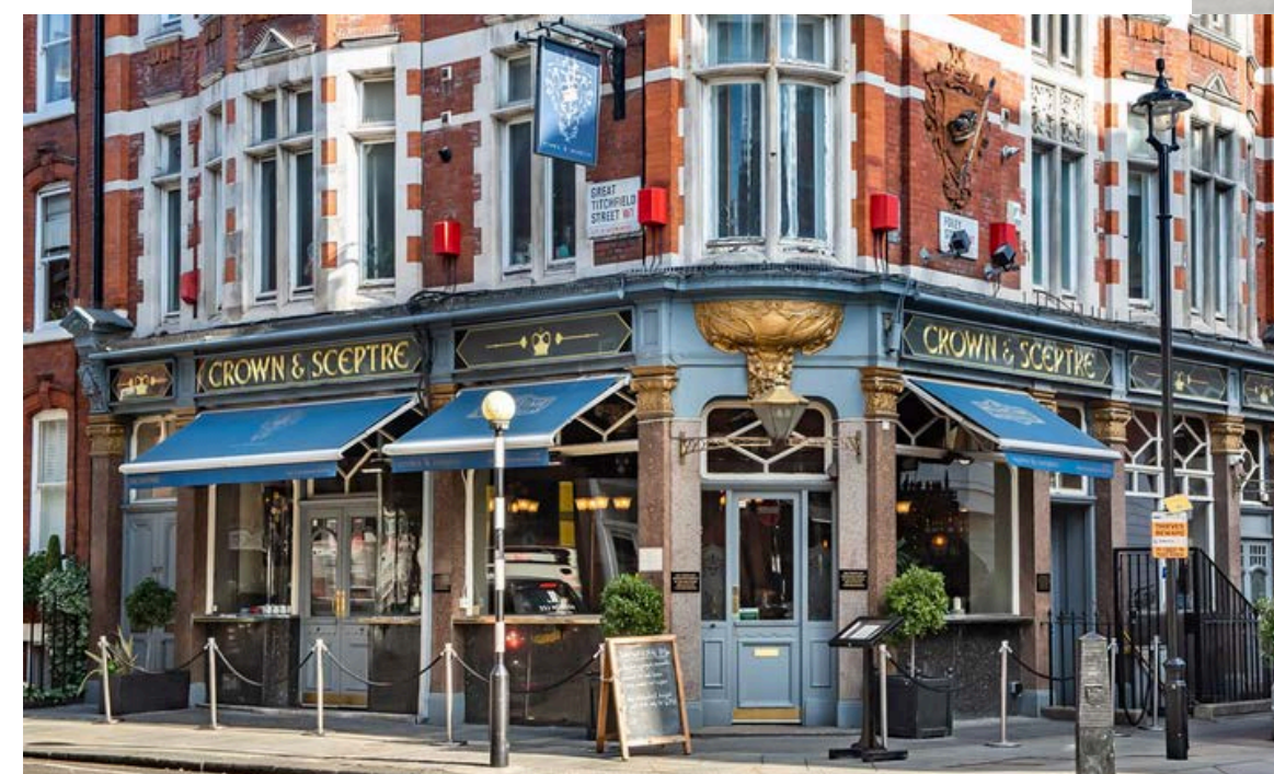
Crown & Sceptre Pub