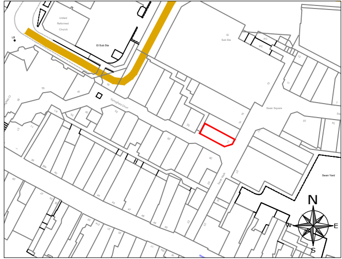
LOCATION PLAN SCALE 1:2000