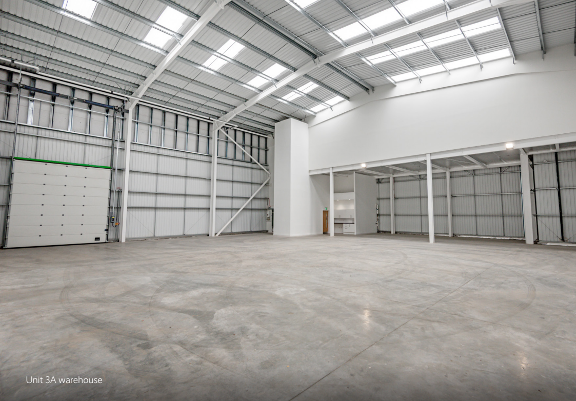
Unit 3A warehouse