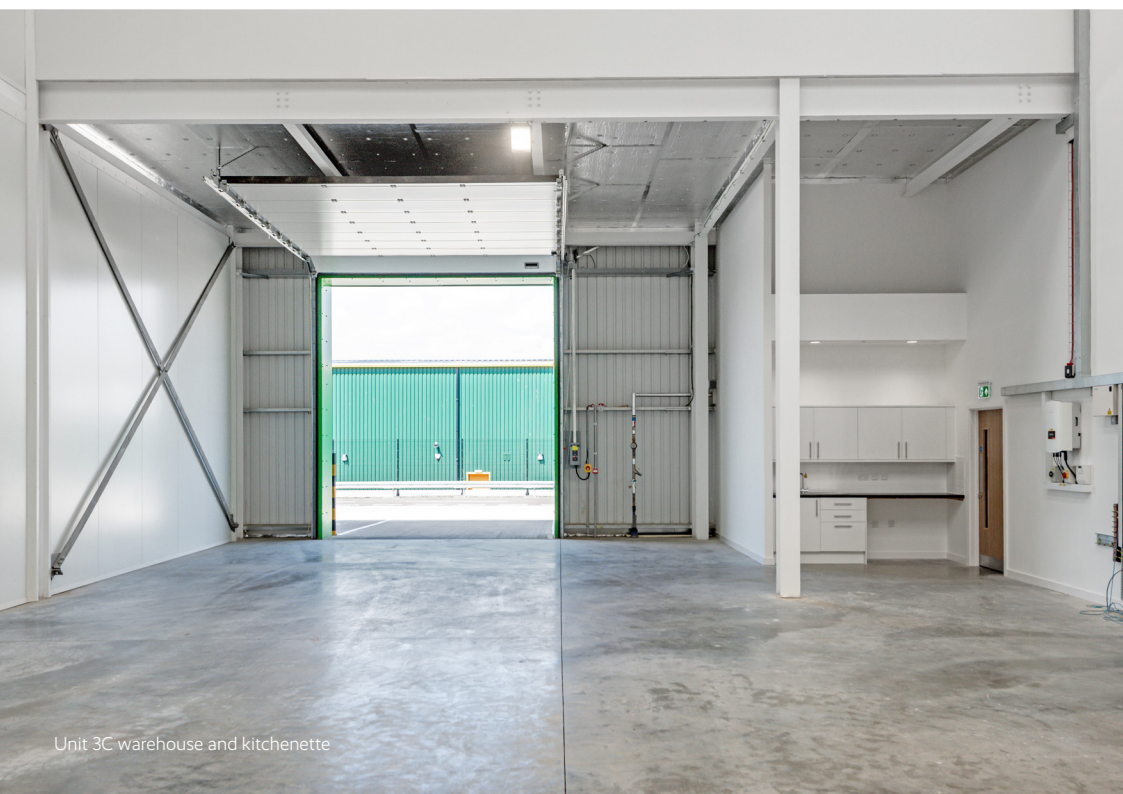
Unit 3C warehouse and kitchenette