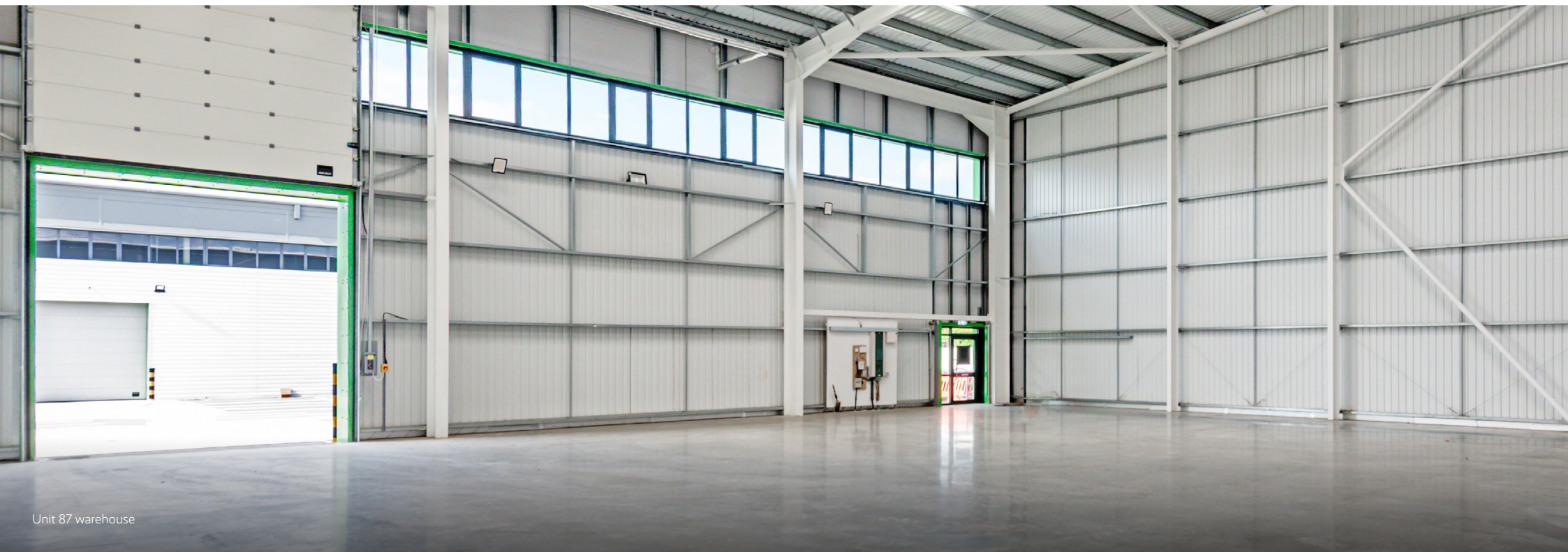
Unit 87 warehouse