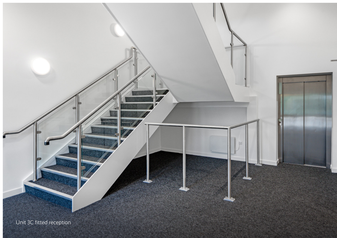
Unit 3C fitted reception