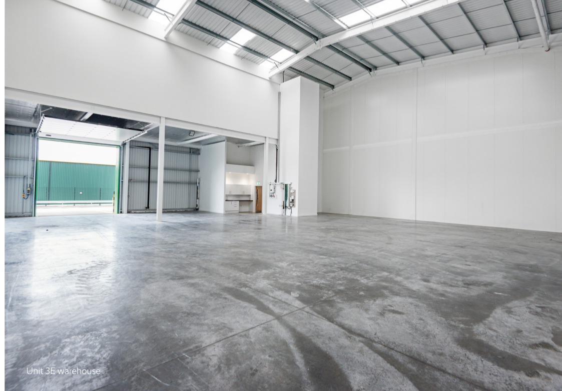
Unit 3E warehouse