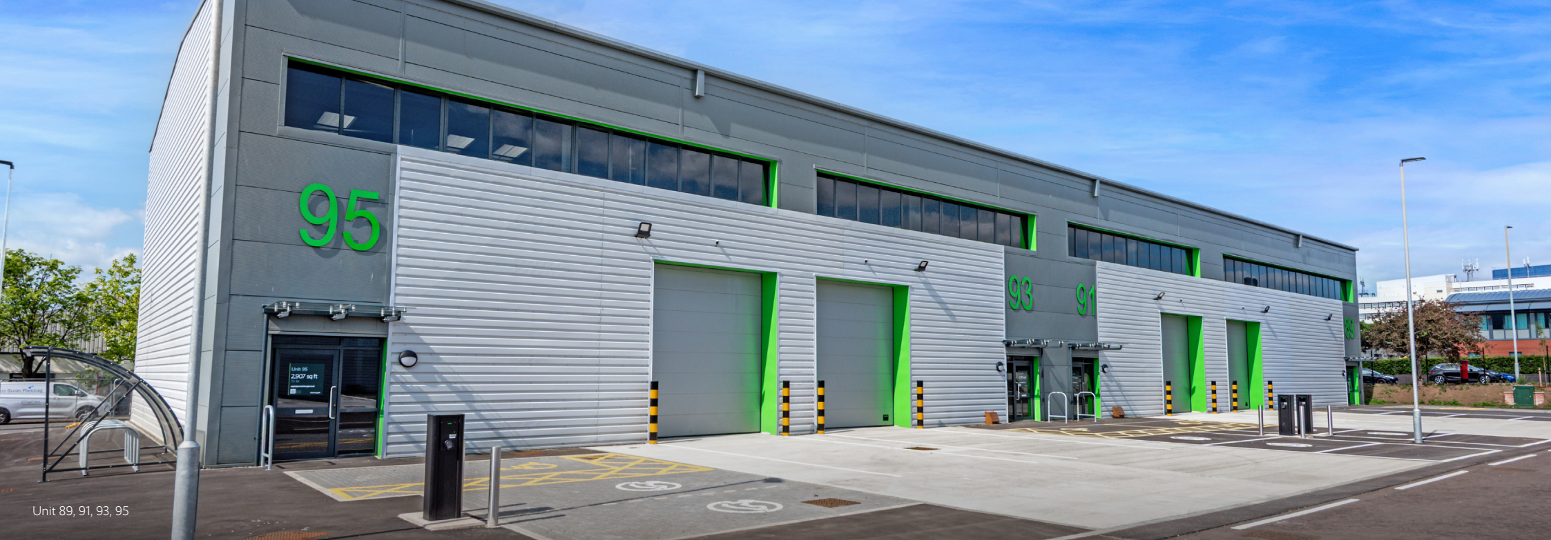
Unit 89, 91, 93, 95