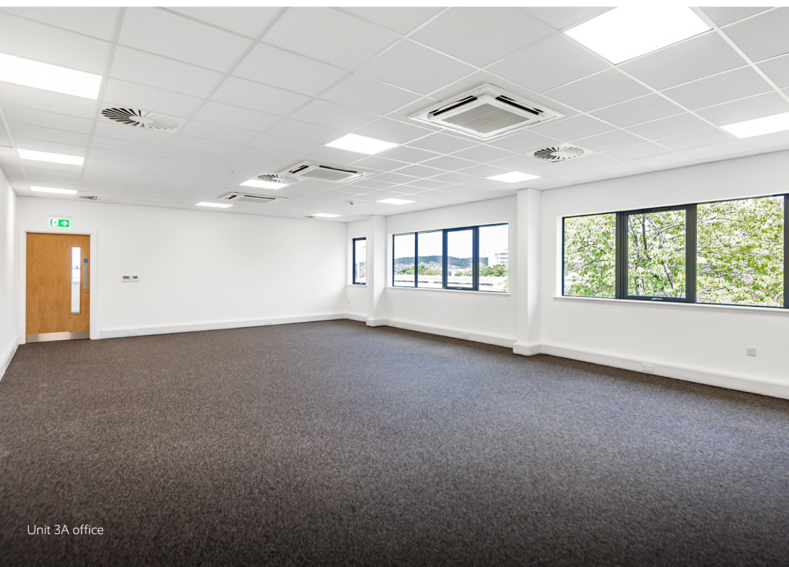
Unit 3A office