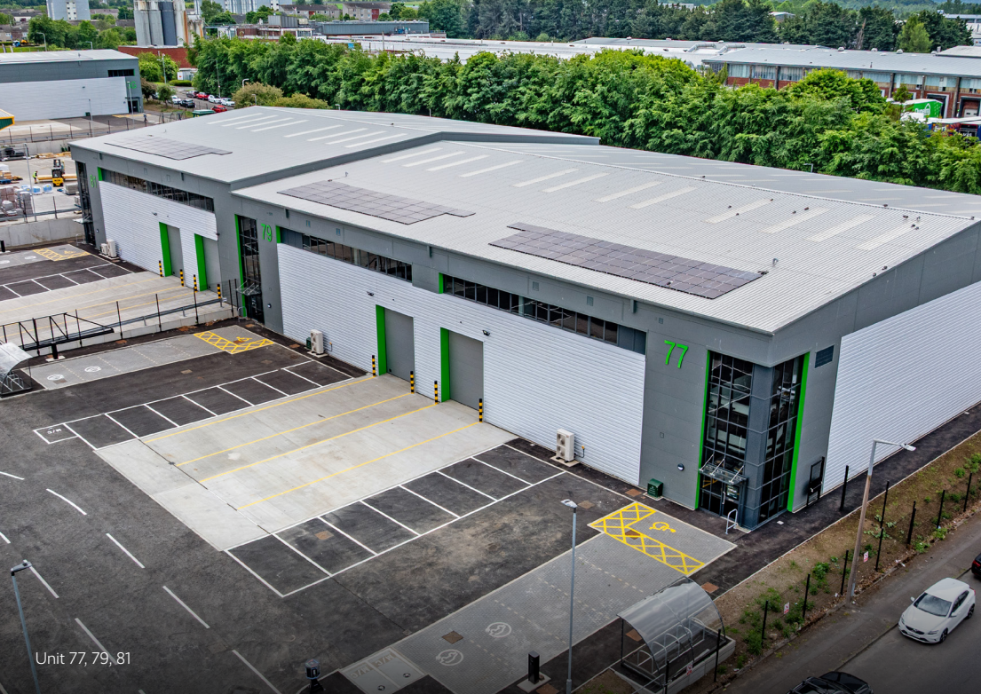
Unit 77, 79, 81