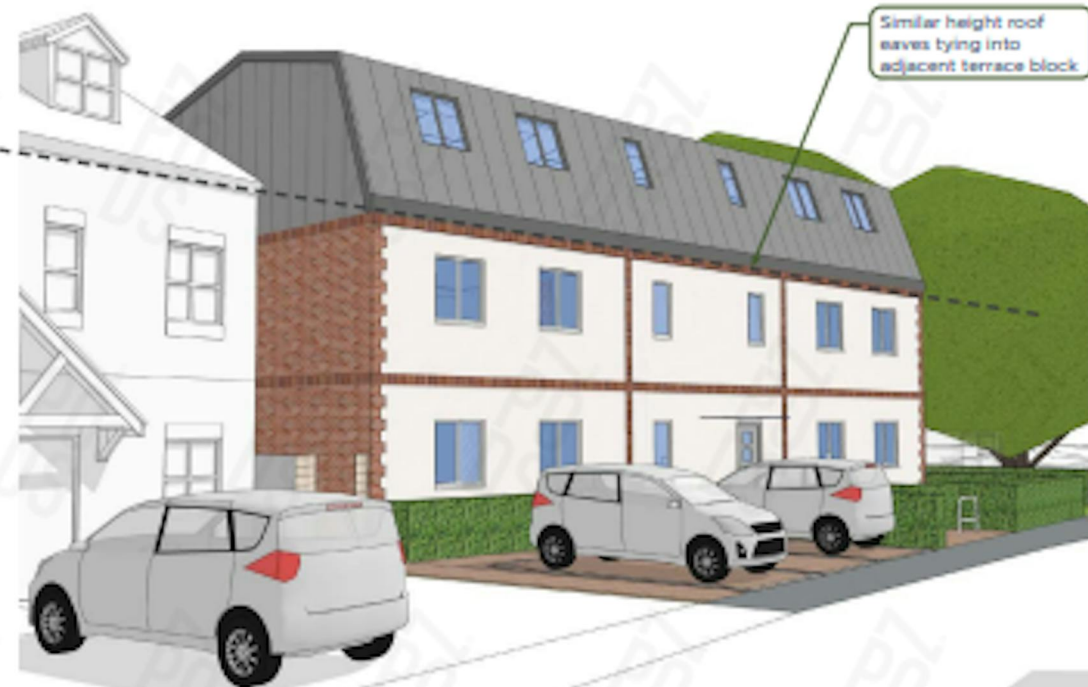
Proposed street view from the Rogers Court