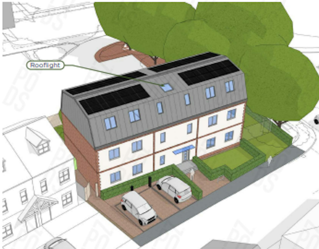
Proposed aerial view from the Rogers Court